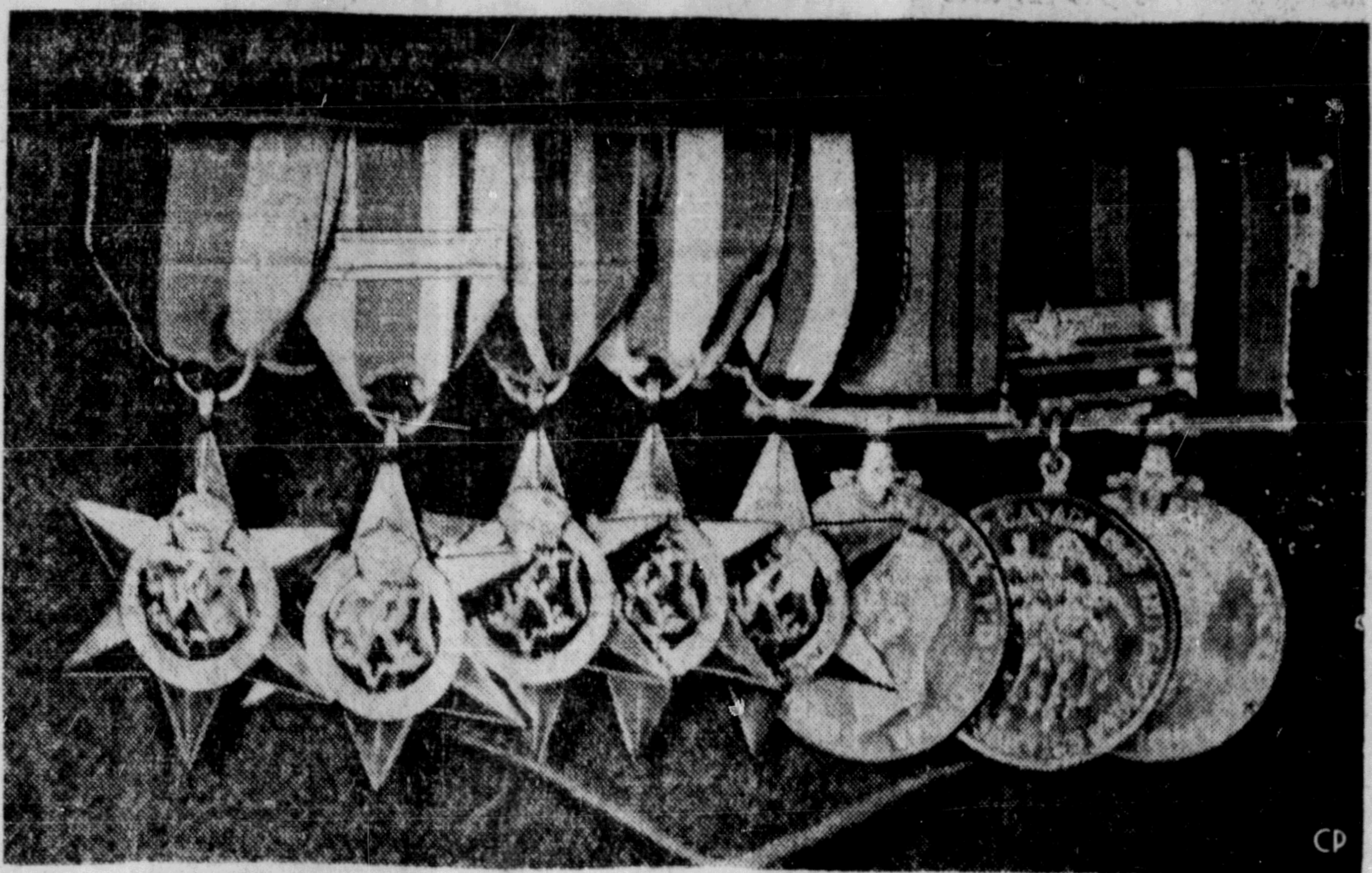
HERE'S FULL QUOTA —This army chest is wearing its full quota of Second World War campaign stars and medals, now being distributed. Regard less of how many stars a person may have qualified for, no more than five may be awarded. This is Canadian Army photo shows one of several theoretical combinations of the five. Left to right are: the 1939-45 Star, African Star with 8th Army Clasp, Pacific Star, Italy Star, France-Germany Star and the three service medals—Defence Medal, Canadian Volunteer Service Medal and Clasp and War Medal, 1939-45. (C.P. Photo)

Notice is hereby given that the reserve against the disposition of crown petroleum and natural gas on Queen Charlotte Islands will be lifted at 12 o'clock noon February 1, 1950, after which time applications for permits under the provisions of the "Petroleum and Natural Gas Act" may be submitted to the Superintendent of Lands, Department of Lands and Forests, Victoria. George P. Melrose Deputy Minister of Lands and Forests Victoria, B. C. January 13, 1950. (25)