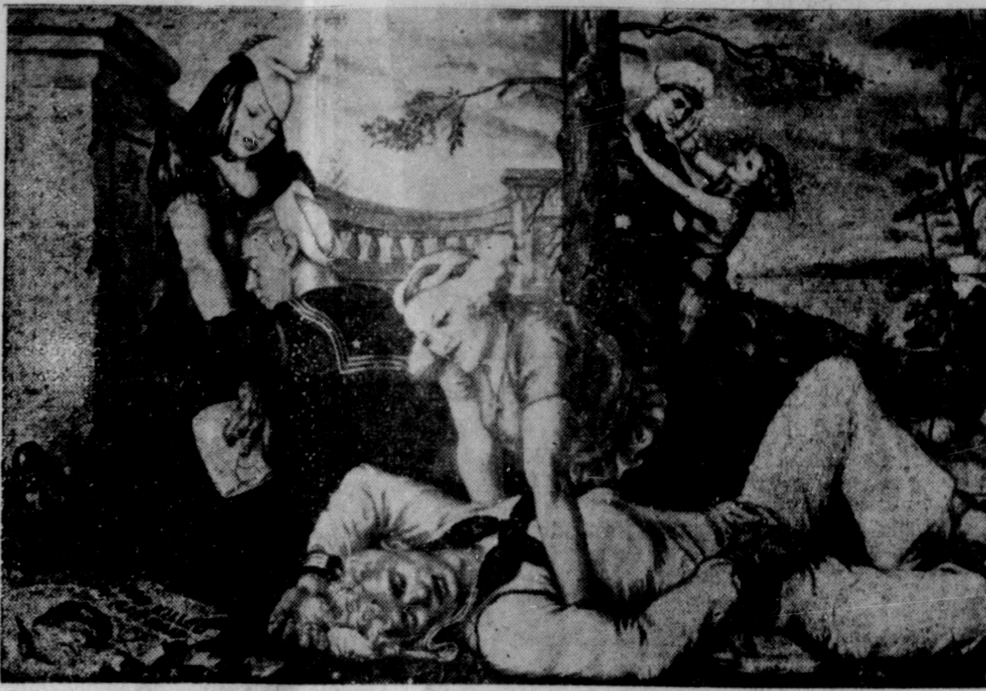
"SAILORS AND FLOOZIES" — This painting caused an uproar in Toronto's civic circles. The dispute started when it was decided that "Sailors and Floozies," painted by New York artist Paul Cadmus, would be hung in the Canadian National Exhibition's art gallery. The C.N.E.'s fine art committee says it is an excellent work of the realistic school. A section of city council — plus churchmen — demanded it be banned to protect the city's well-being.

TUESDAY - P.M. 4:00—Meet Gisele 4:15—Stock Quotation and Int. 4:30—Prairie Folk 4:45—Western Five 5:00—Geo. C. Rowe and Orch. 5:30—Don't D own 5:45—Lyrical Lady 5:55—CBC News 6:00—Supper Serenade 6:15—Sammy Kaye and Orch. 6:30—Musical Varieties 7:00—CBC News 7:15—CBC News Roundup 7:30—Leicester Square to Broadway 8:00—Science Reporter 8:15—Preacher's Diary 8:30—Record Album 9:00—Hon. Brooke Claxton and W. A. Curtis 9:15—Time, Space and Echoing Themes 9:30—Jake and the Kid 10:00—CBC News 10:10—CBC News 10:15—Miscellany 10:30—Presenting Charles Boyer 11:00—Weather Report 11:04—Sign Off WEDNESDAY - A.M. 7:00—Musical Clock 8:00—CBC News 8:10—Hee's Bill Good 8:15—Morning Song 8:30—Music for Moderns 8:45—Little Concert 9:00—BBC News & Comty. 9:15—Morning Devotions 9:30—Sunrise Serenade 9:45—Famous Voices 9:59—Time Signal 10:00—Morning Visit 10:15—Morning Melodies 10:30—Melody Time 10:45—Invitation to the Waltz 11:00—A Man and His Music 11:15—Roundup Time 11:30—Weather Report 11:31—Message Period 11:33—Recorded Interlude 11:45—Scandinavian Melodies P.M. 12:00—Mid-Day Melodies 12:15—CBC News 12:25—Program Resume 12:30—B. C. Farm Broadcast 12:55—Recorded Interlude 1:00—The Concert Hour