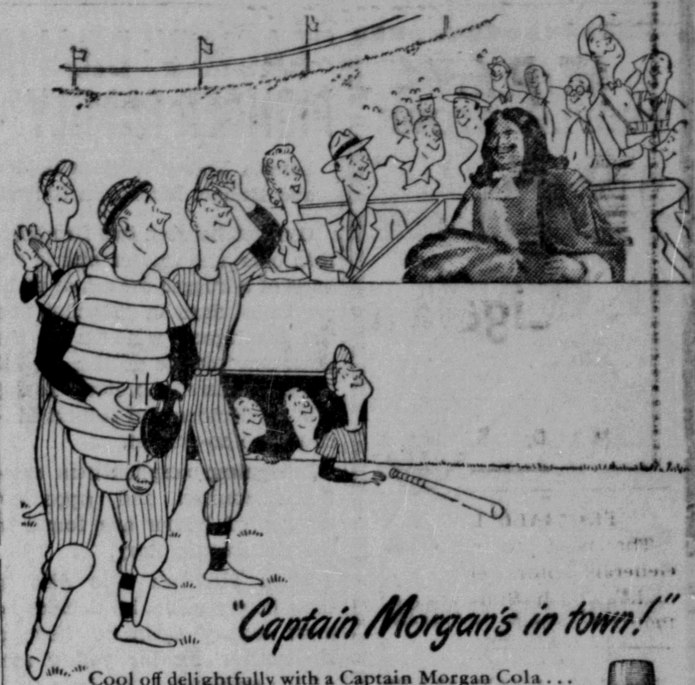
"Captain Morgan's in town!"

Cool off delightfully with a Captain Morgan Cola... Squeeze juice 1/2 lime in a 10-oz. Collins glass and drop in lime shell. Add 3 cubes ice, 1 1/2 ounces Captain Morgan Gold Label and fill glass with Cola. Serve with a stir rod. It's a home run!