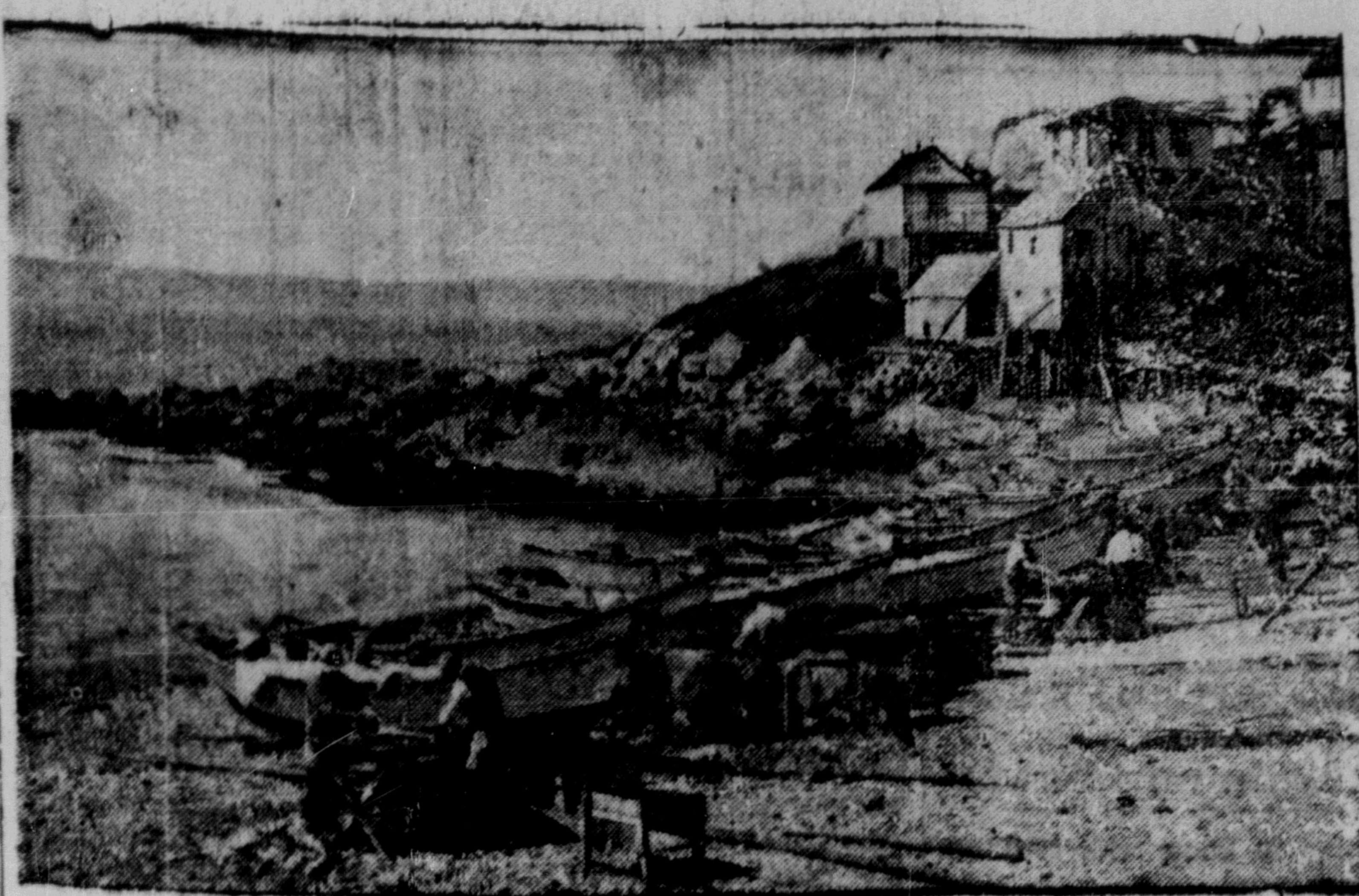
COLONY'S MAIN INDUSTRY —Fishing has become the main industry of the old French colony of St. Pierre et Miquelon, located off the south coast of Newfoundland and France's only possession in North America. Here fishermen of the fishing village of Savoyard on St. Pierre mend their nets beside their unique double-enders dories.