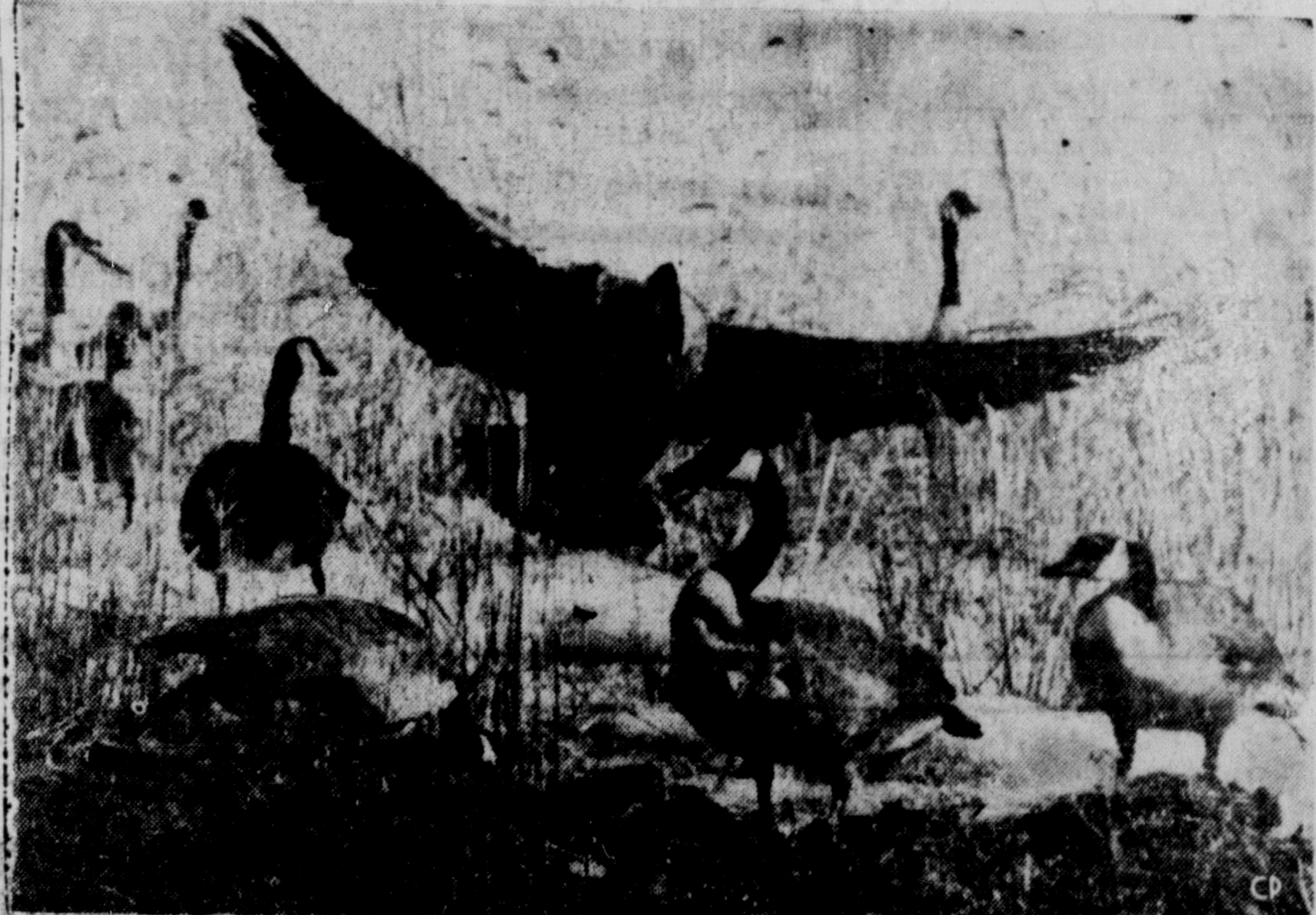
FREE AT LAST—Eighty Canada geese stretch their wings and flap from a wire pen into the windy skies above Delta Waterfowl Research Station on the southern tip of Lake Manitoba. They were released as part of an experiment to re-establish birds on the marsh. Wild Canada geese have not bred there for many years.