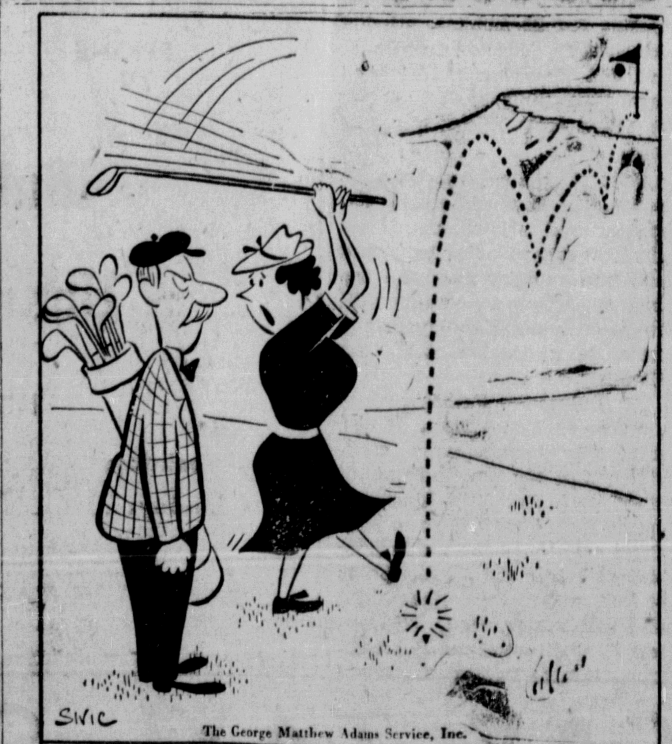
The George Matthew Adams Service, Inc.

To insure publication of, display or classified advertising copy for same must be in the office of the Daily News by 4 p.m. the day previous to advertising. Requirements of the mechanical department make this rule necessary.