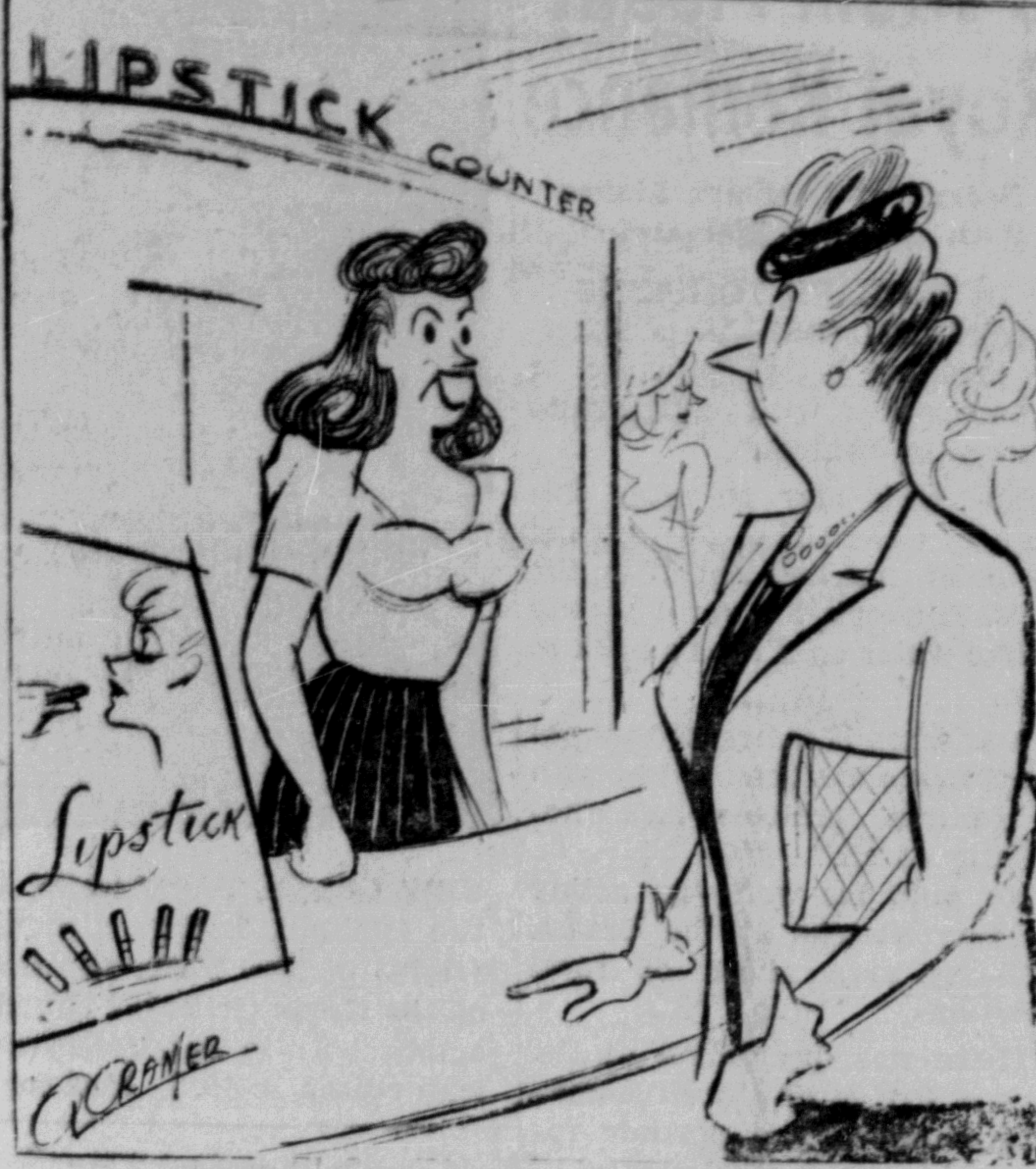
"We have all prices—do you kiss much?"