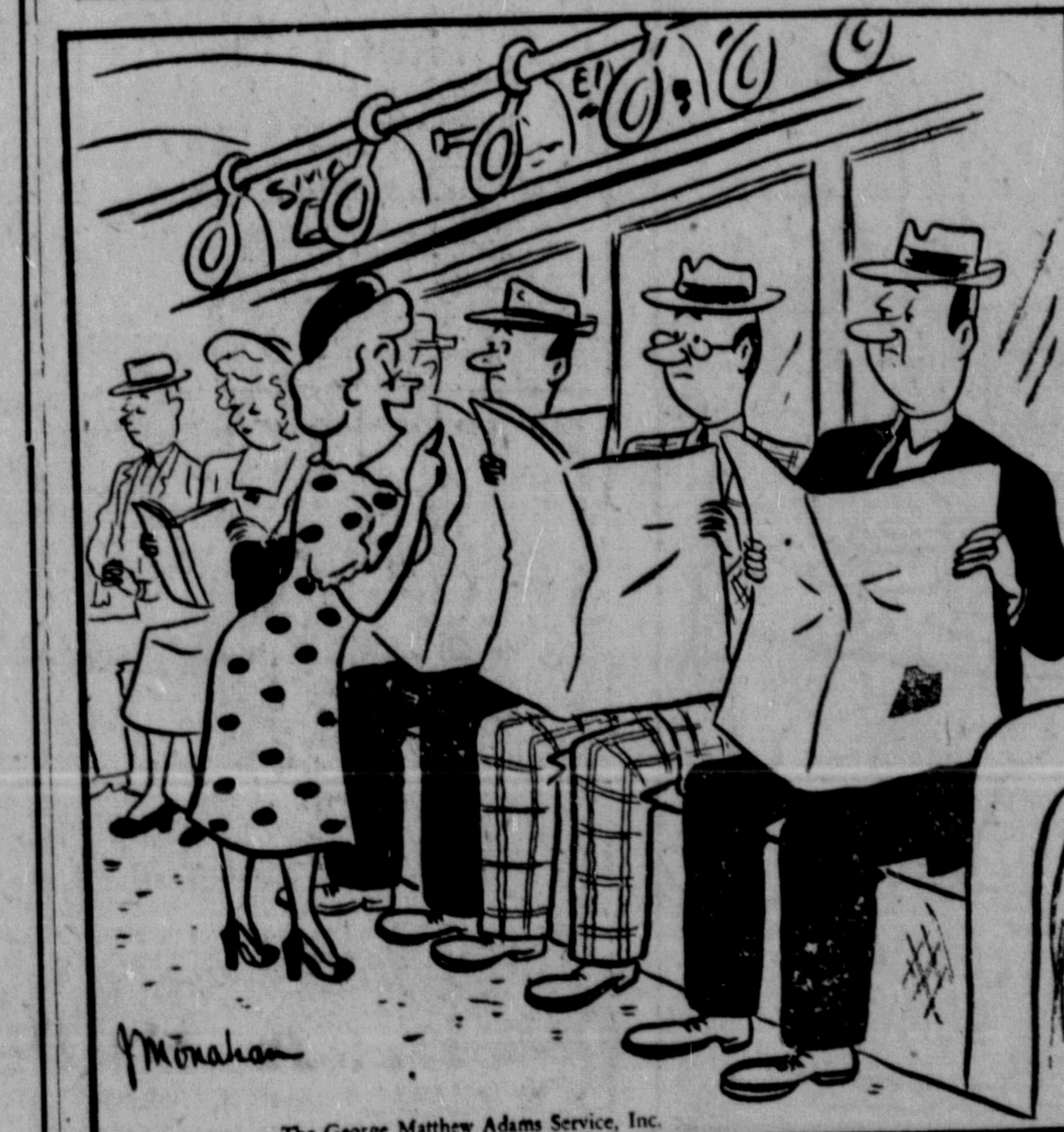
The George Mathew Adams Service, Inc.