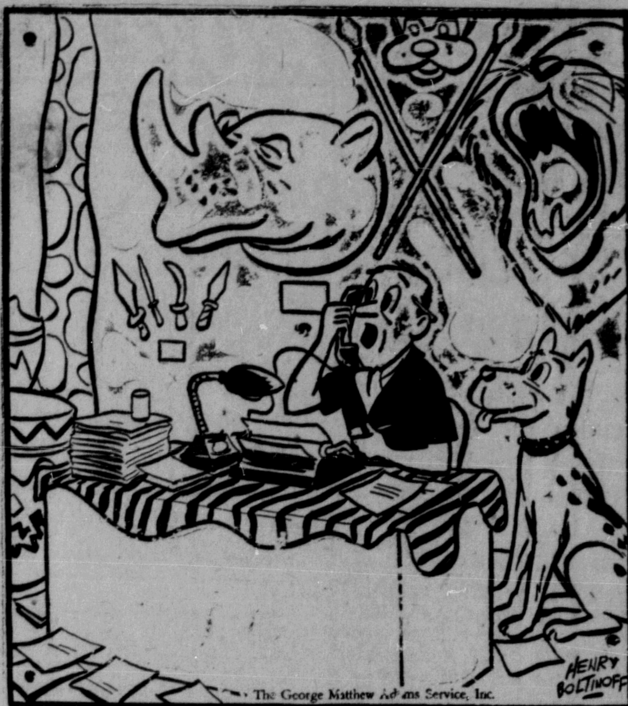
"Not tonight, Joe. I've got to finish my serial for 'Honeymoon Love Stories!'"

The meeting ended on a note of goodwill for the year past and that ahead.