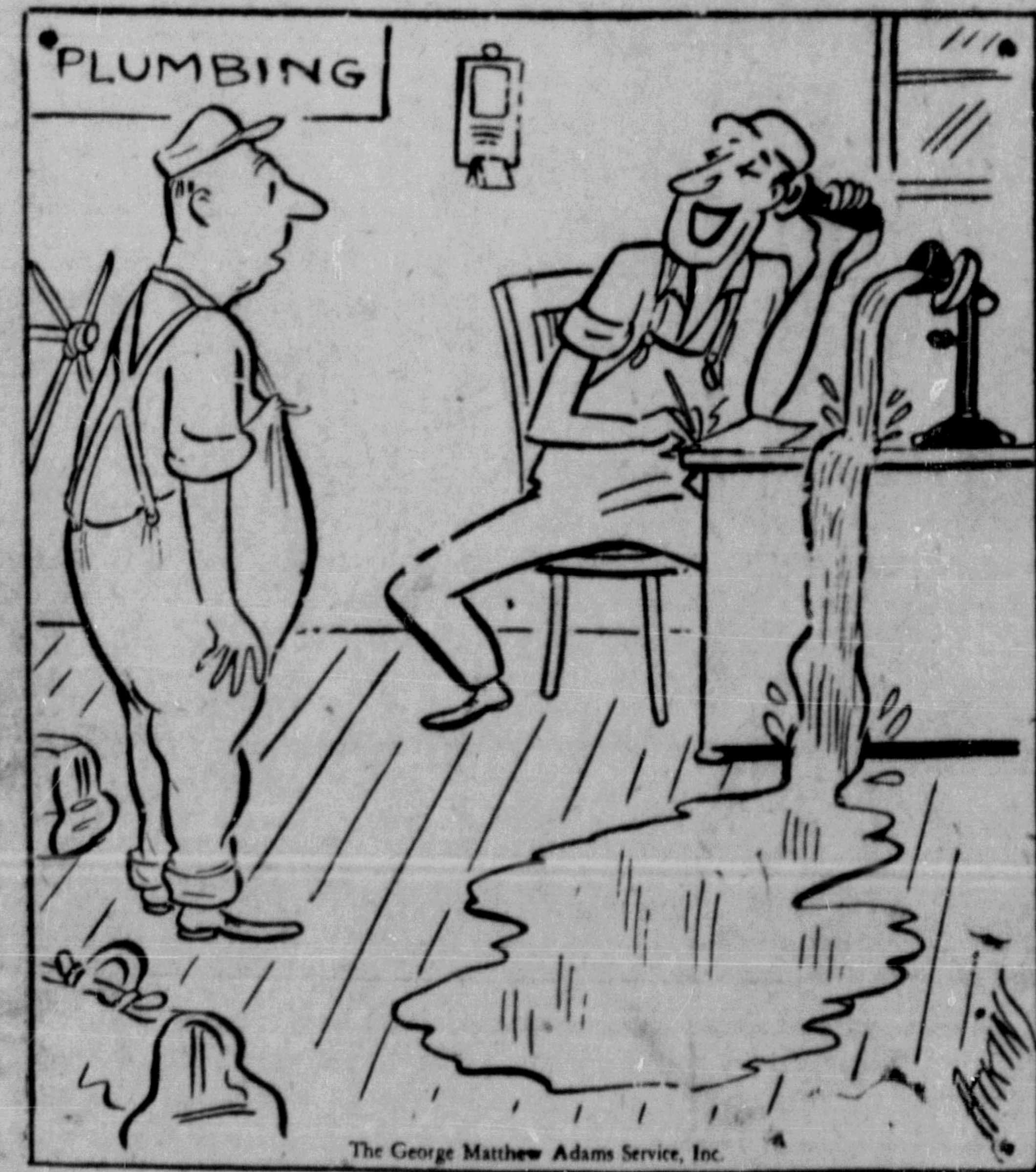
"He said he'd appreciate it if we rushed right over."