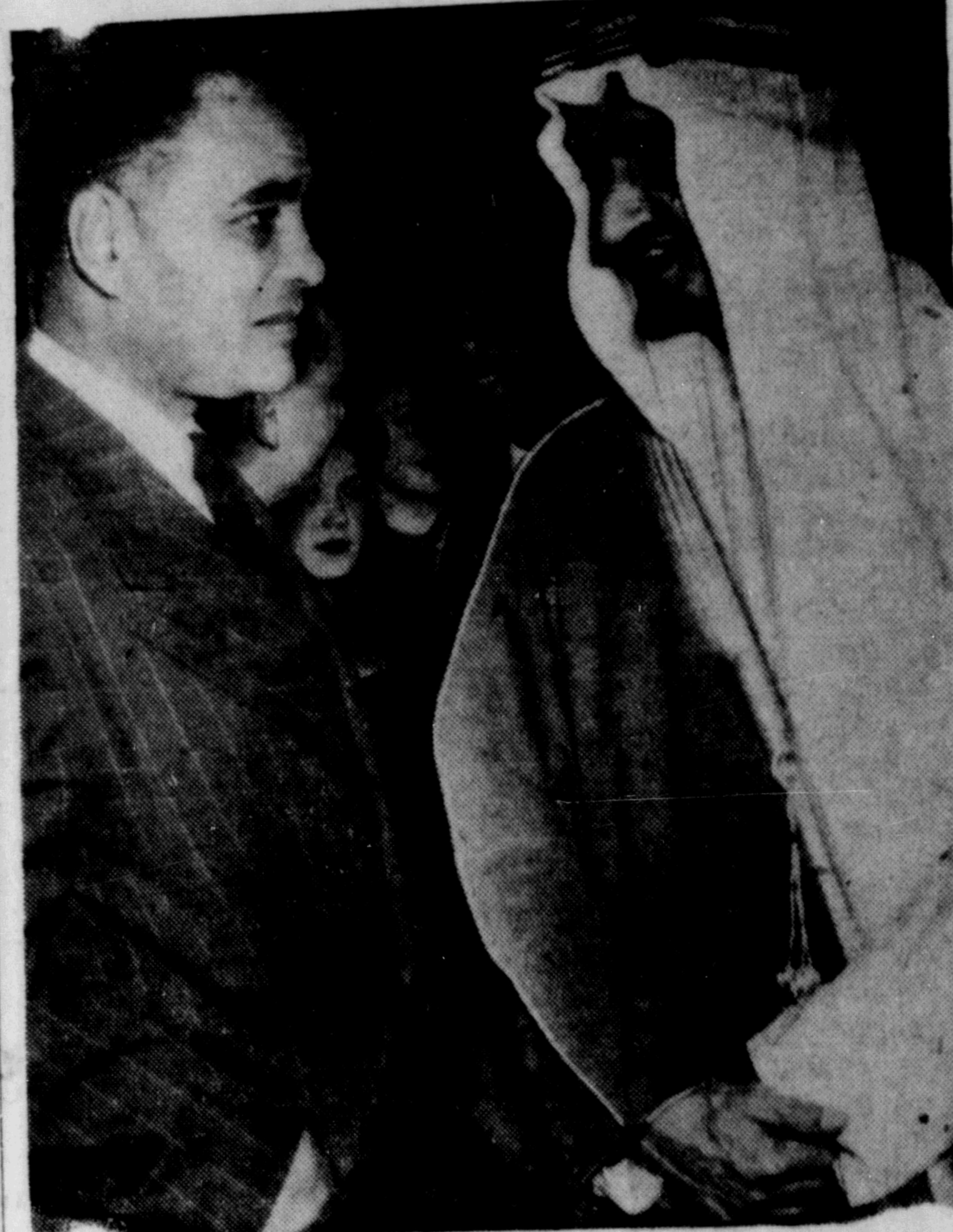
TIME OUT FOR THE GENERAL ASSEMBLY—The Arabian delegates to the United Nations General Assembly in Paris were guests at a party given them and attended by many important personages of the United Nations. Prince Feisel of Saudi Arabia is shown at the party chatting with U.N. Mediator Ralph Bunche. Obvious by the absence were the Israel delegates to the U.N.