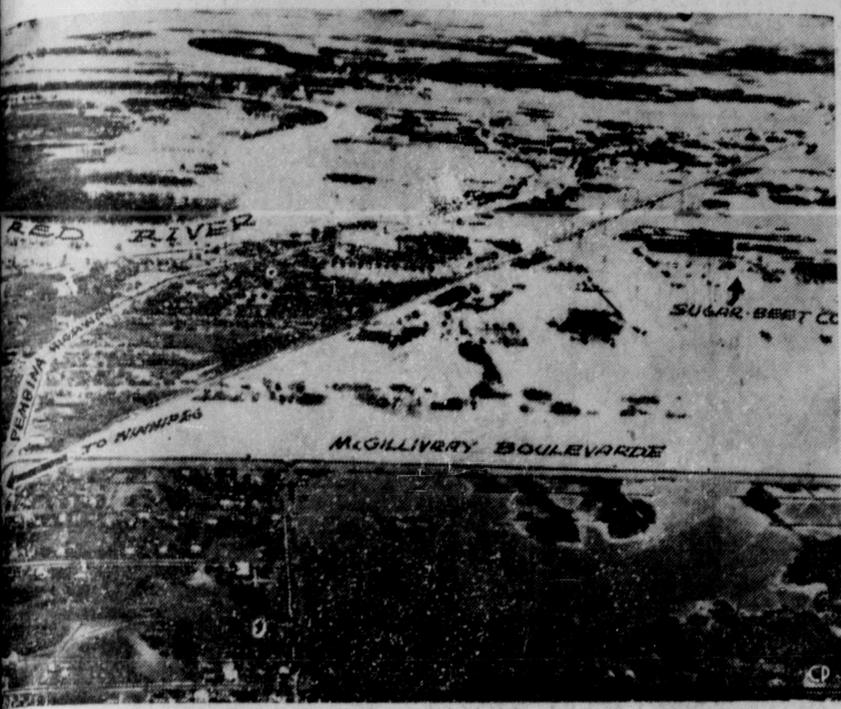
OF WATER—This air photo shows how surface flooding in McGillivray Boulevard in sub-urban Port Garry formed an arrow of water pointing at Winnipeg. The Red River's normal course, at centre left, is only a small percentage of the water area. Flood waters building up on sides of the railway track to the left of the sugar beet factory forced railway workmen to dig a 100-foot hole to relieve pressure on McGillivray Boulevard.

The Daily News Is Receiving Subscriptions