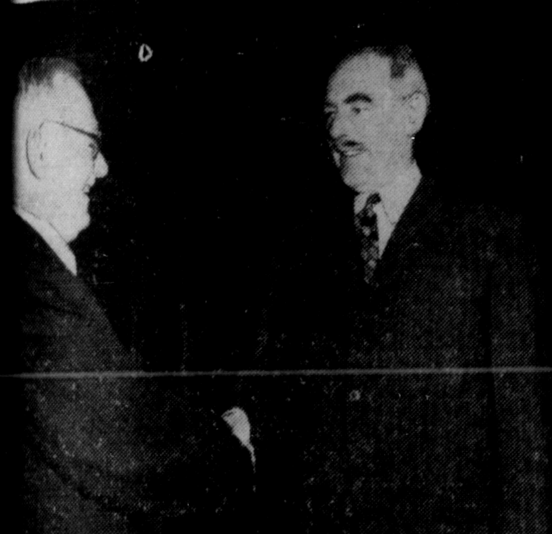
Vishinsky (left), Foreign Minister of the USSR, and Dean Acheson, Secretary of State of the USA, greet each other at the United Nations General Assembly, now meeting at Flushing Meadows, New York. Sign ministers of 28 countries attended the opening session.