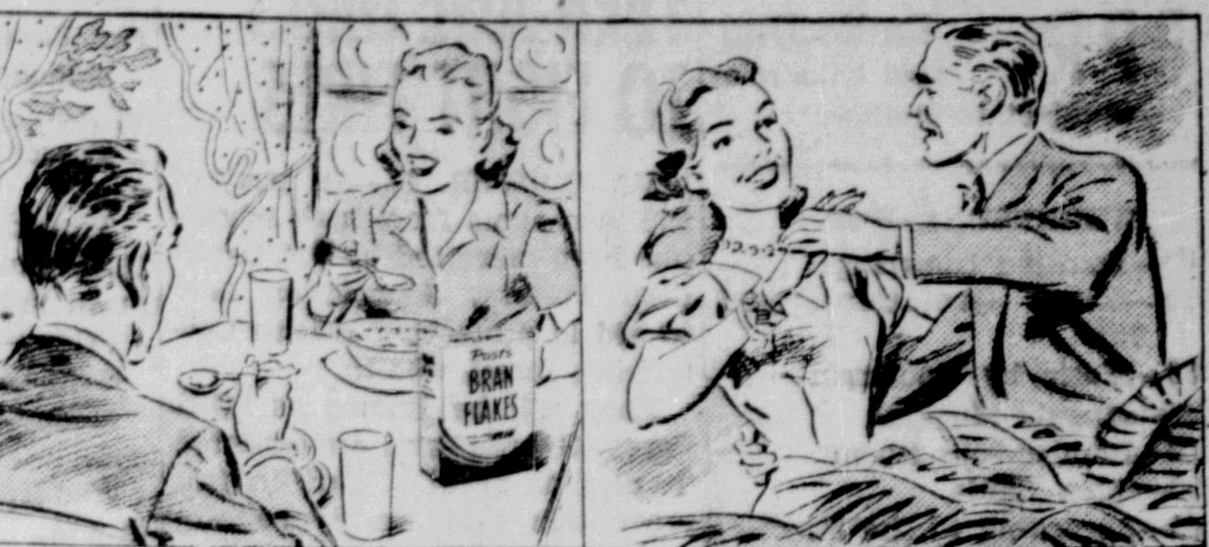
It's time you tried THIS SURE IT'S POST'S BRAN FLAKES YOU NEED—REGULARLY!