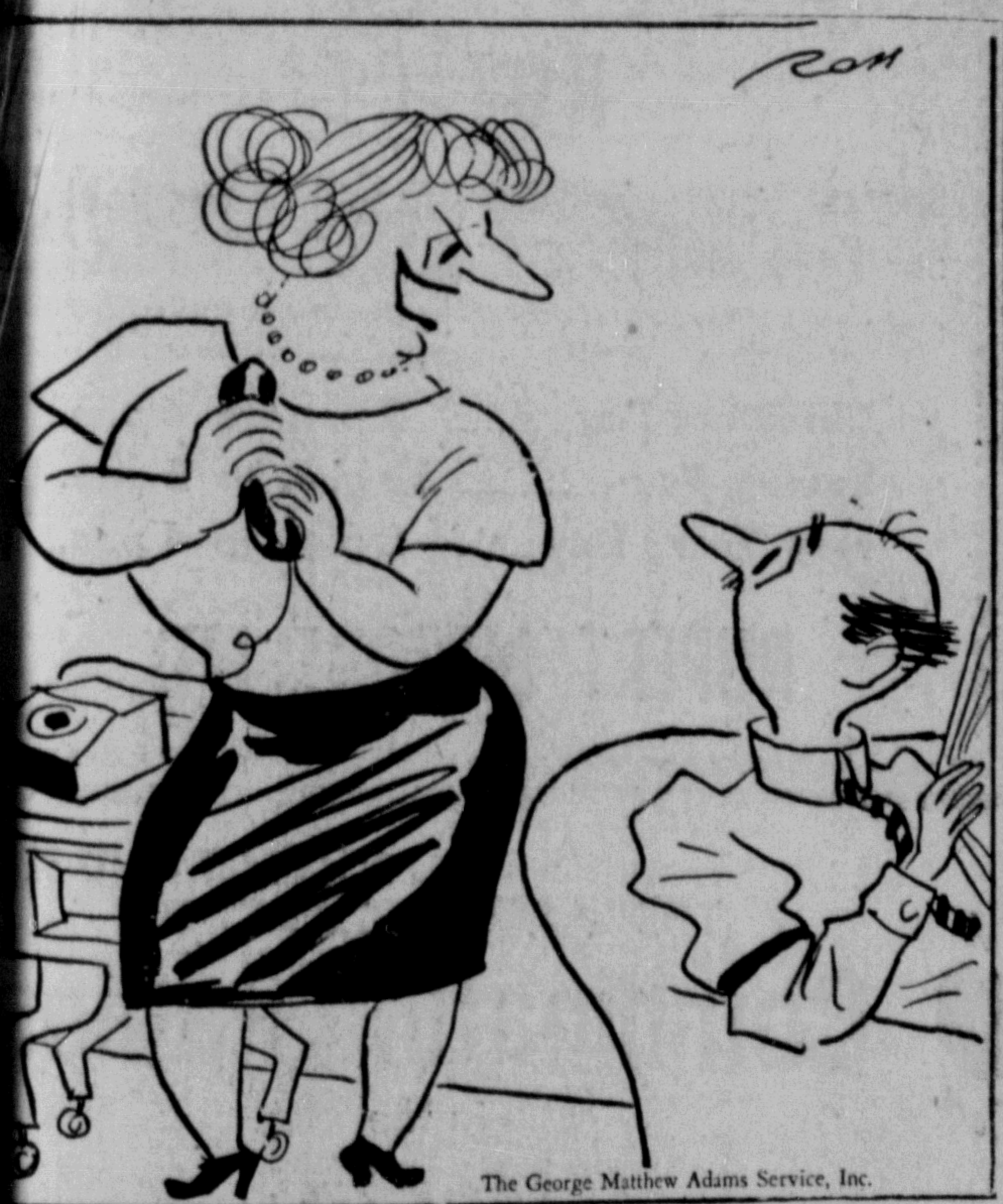
"Mother wants to spend a couple of months with us. Got any—ha-ha-ha—objections?"