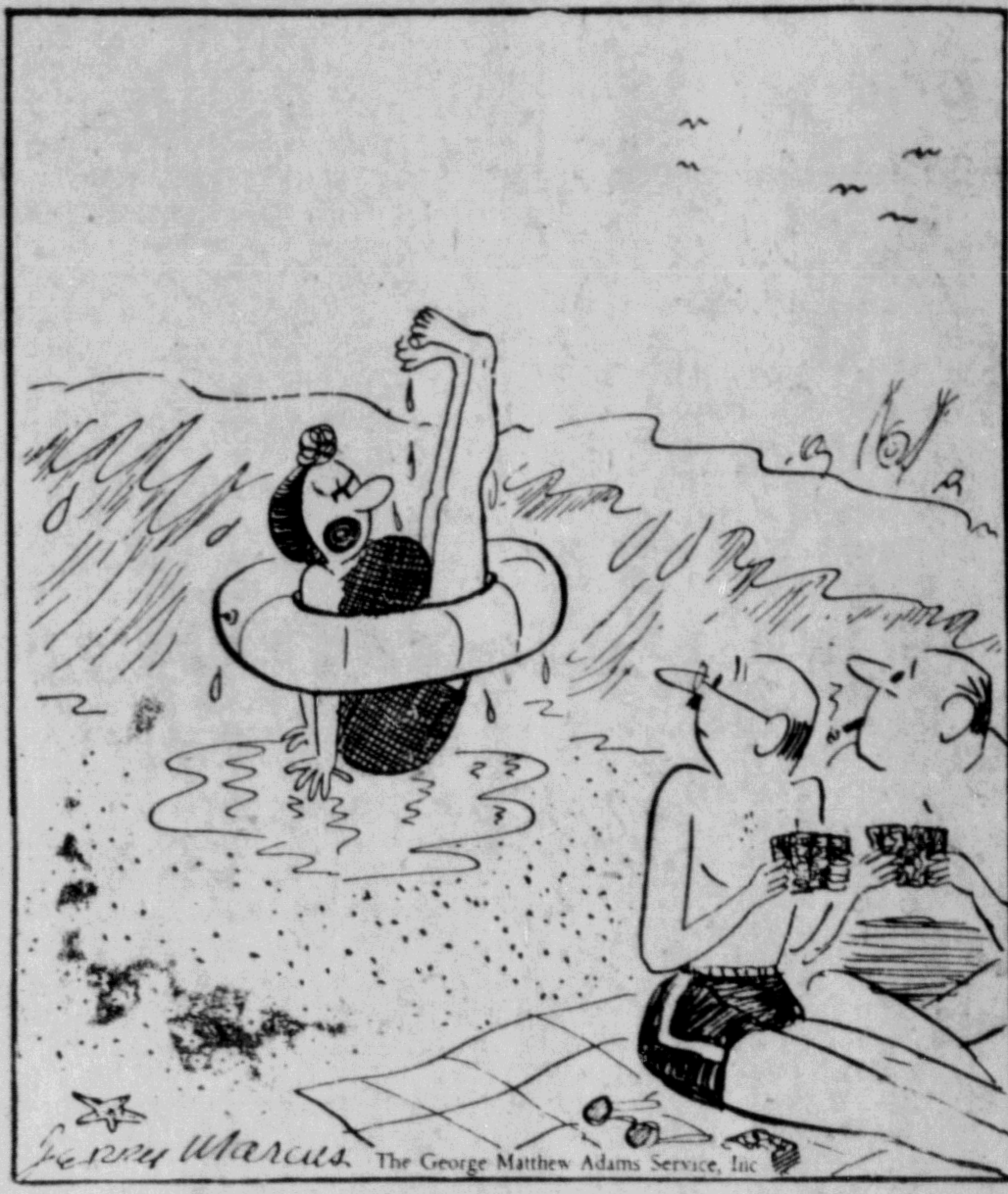
"Well, just don't sit there!"