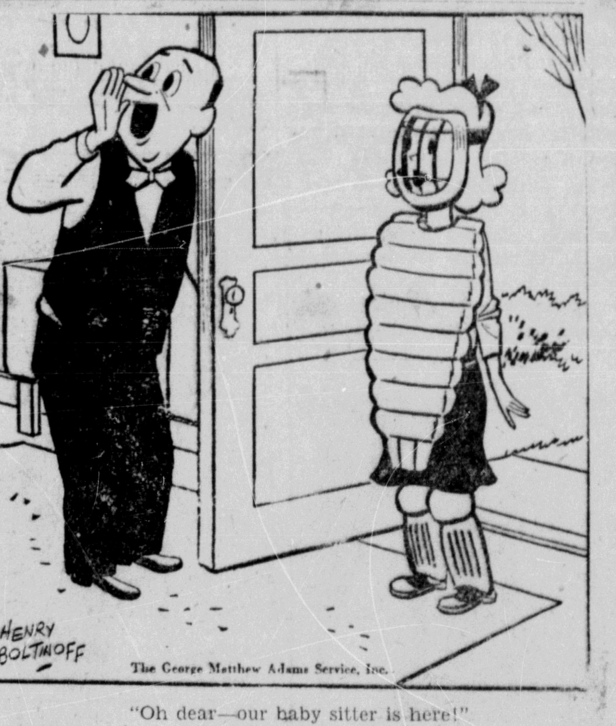
"Oh dear—our baby sitter is here!"