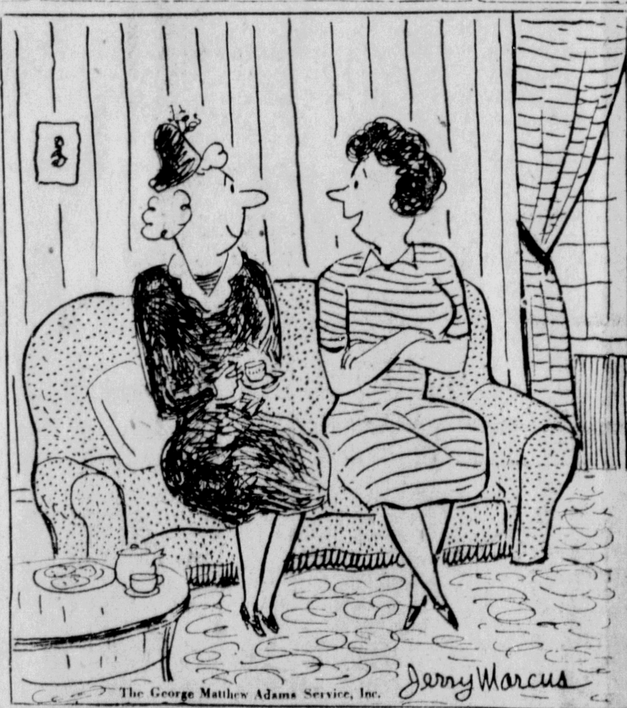
"George never remembers our wedding anniversary. I just remind him of it in February and July, and get two presents."

It's business wise to advertise. Advertise in the Daily News.