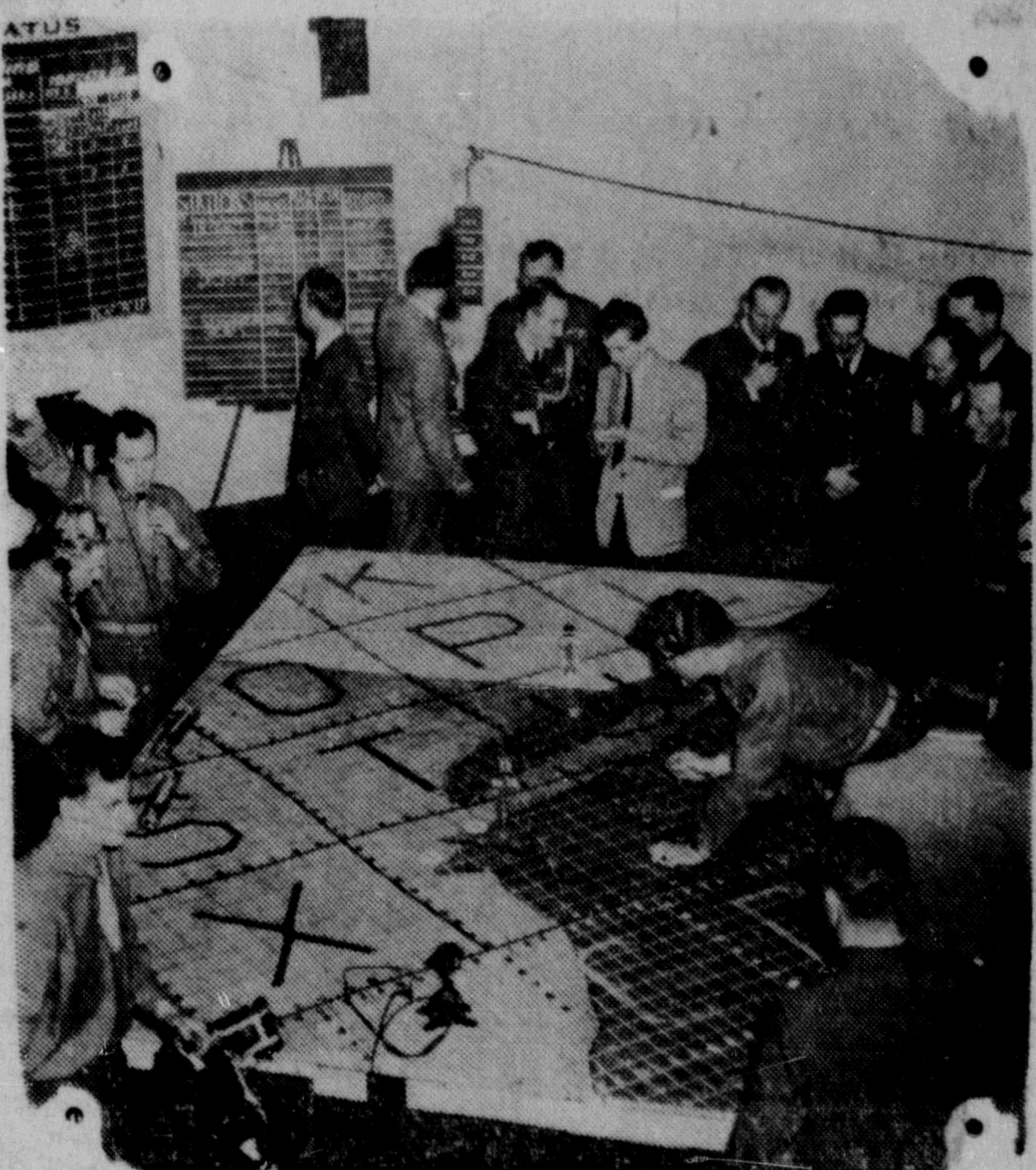
"DEFENDERS" SAVE NEW YORK —R.C.A.F. reserve and U.S. National Guard airmen punched out a clear-cut victory against "enemy" air raiders, bent on the total destruction of New York in a mock attack on the city by B-29 bombers. Not one air "bandit" was allowed to reach the outer perimeter of New York. Guardsmen are shown busily placing markers on the operations board showing the location of attacking bombers and intercepting aircraft. Eight Canadian jet Vampires were among the defenders.