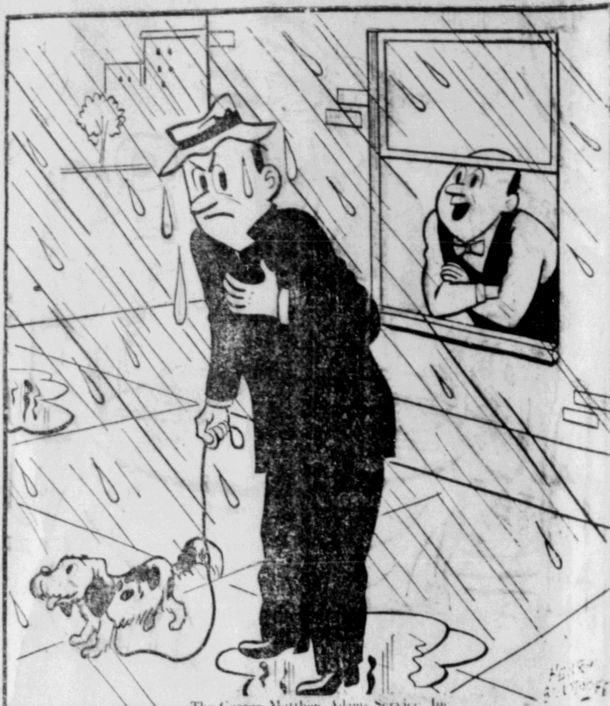
"You the fella who said he wouldn't have a baby and push a carriage in the street?"