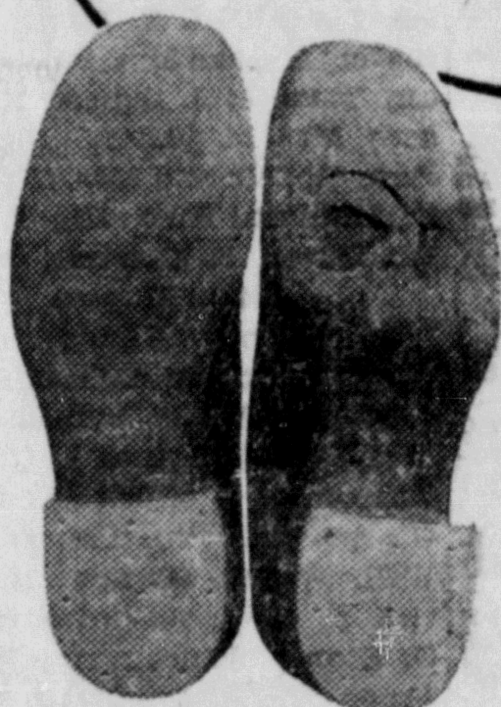
Unretouched photograph shows hole worn in leather sole (right). Note good condition of NEOLITE sole.

On good roads and bad, rain or shine, man's job means lots of walking every shoe you see at right received equal wear in week out—until the leather hole in it!