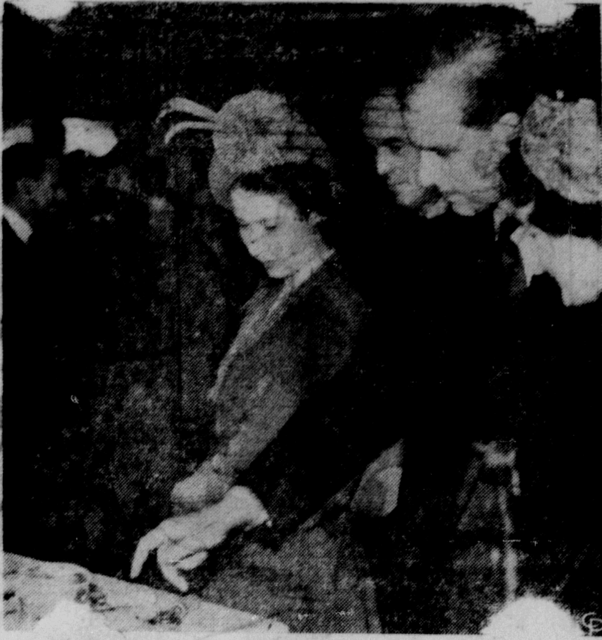
COOKERY HINTS FOR THE PRINCESS —Princess Elizabeth and the Duke of Edinburgh, now busily setting up their own home at Windlesham Moor, are photographed at the Ideal Home Exhibition at Olympia, Kensington, London. Here the Duke of Edinburgh draws attention of Princess Elizabeth to a pastry making exhibit.