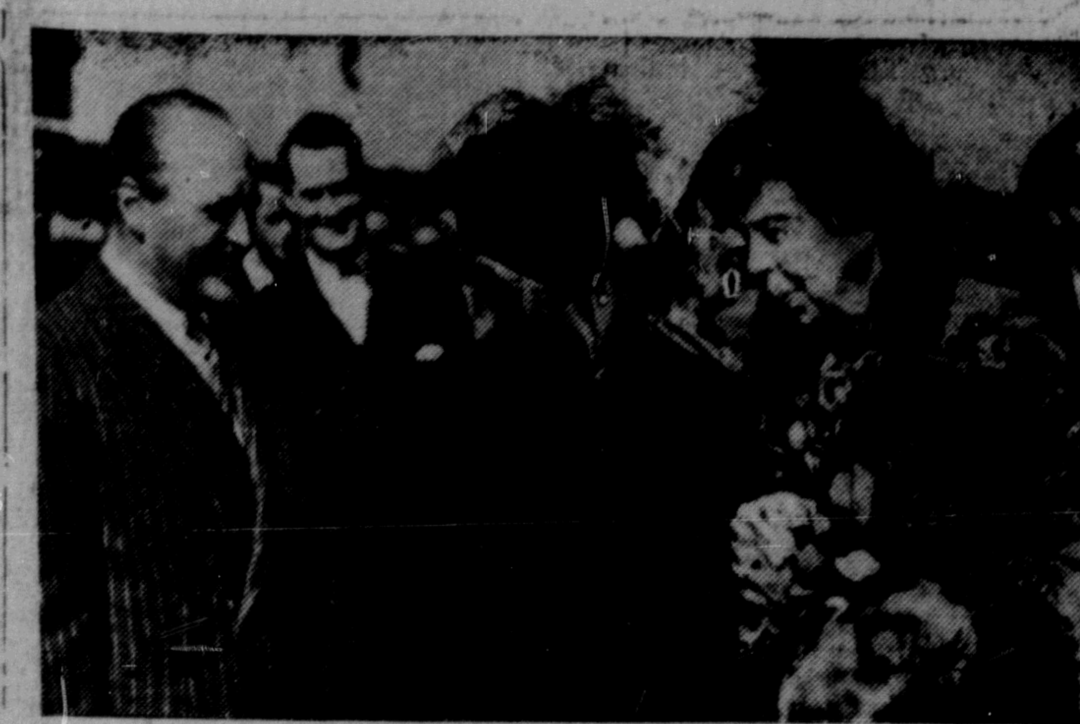
MRS. ROOSEVELT UNVEILS F.D.R. STATUE — Crown Prince Olav, left, and Crown Princess Martha, back to camera, of Norway extend a warm greeting to Mrs. Eleanor Roosevelt, widow of the former U.S. President, on her arrival in Oslo. Mrs. Roosevelt is in Norway to unveil statue of her husband in the Norse capital.