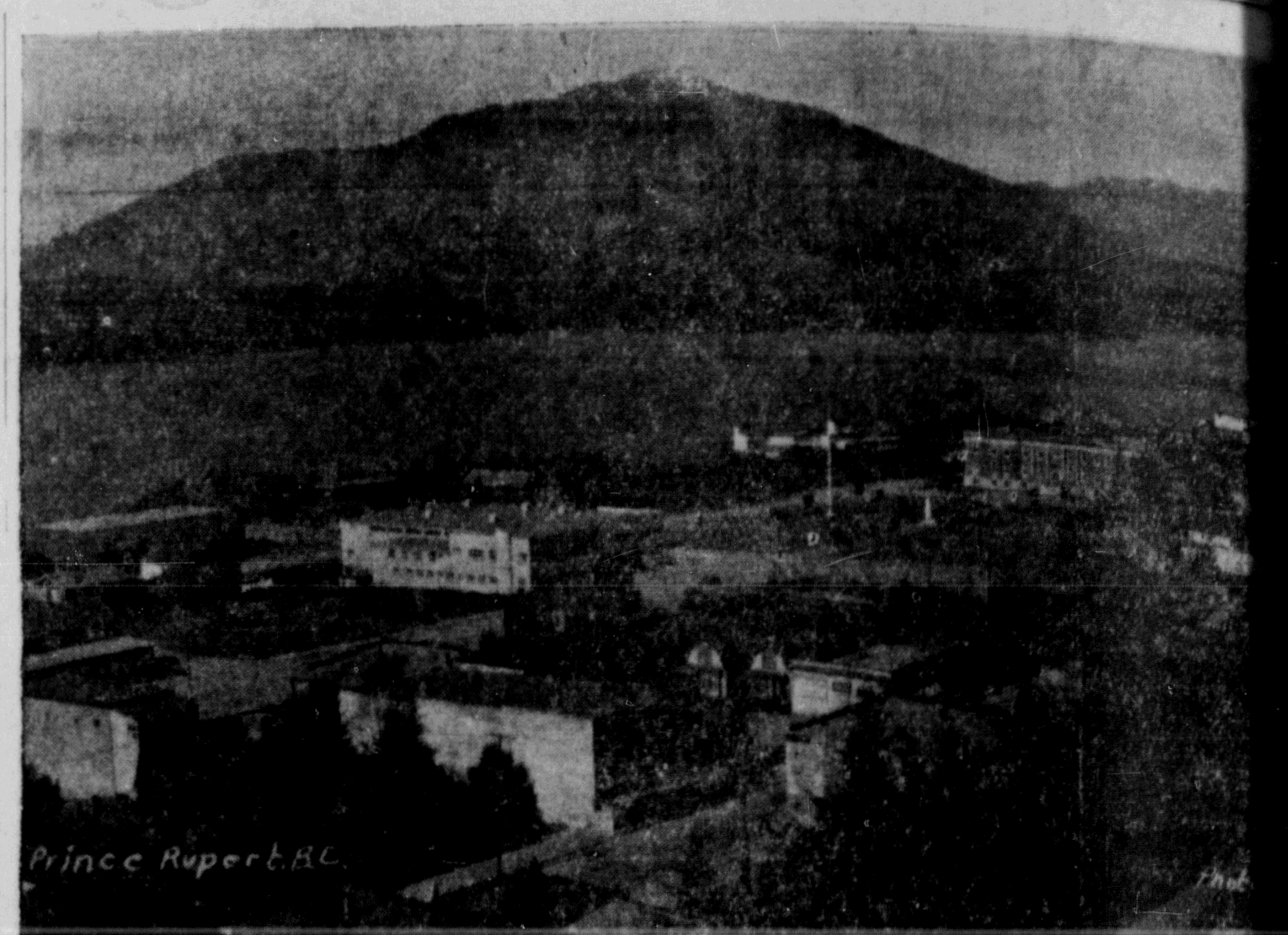
PRINCE RUPERT ATTRACTIVE—Buildings in business section. Court House at right foreground, Civic Centre left centre. Third Avenue in foreground. Looking north towards Mt. Morse.

With, of course, the development of the resources and large settlements of people increasing the amenities of life, I am sure that the Alaskan towns will want to be hooked up by lateral highways to main highways running down through the Groundhog region. They will want tourists to expose the great beauties of our mountains and lakes. They will wish tourists to see the natural wild life and the vast vistas of unexplored regions where the onrush of civilization has yet to change them from frontiers into great highways of trade and commerce. We in Prince Rupert, therefore, have a great stake in the development of Alaska and Alaskan statehood; in fact, we have as much at stake as Alaska herself. It is a great step forward to see