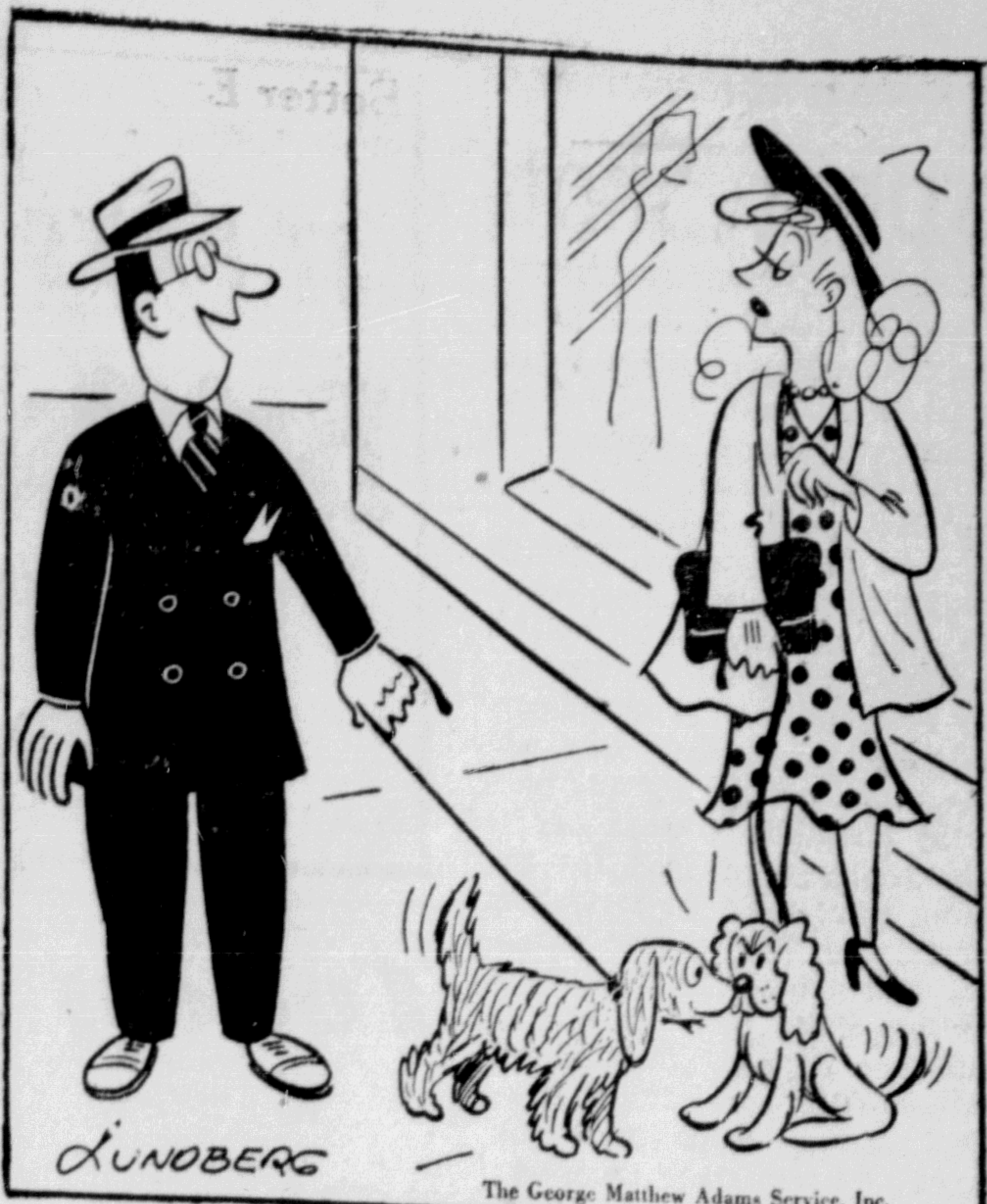
"His name is Skippy—what's yours?"

for Tasty Meals Chop Suey • Chow Mein Chinese Dishes a Specialty Second Avenue opposite Prince Rupert Hotel 7:00 a.m. to 3:30 a.m.