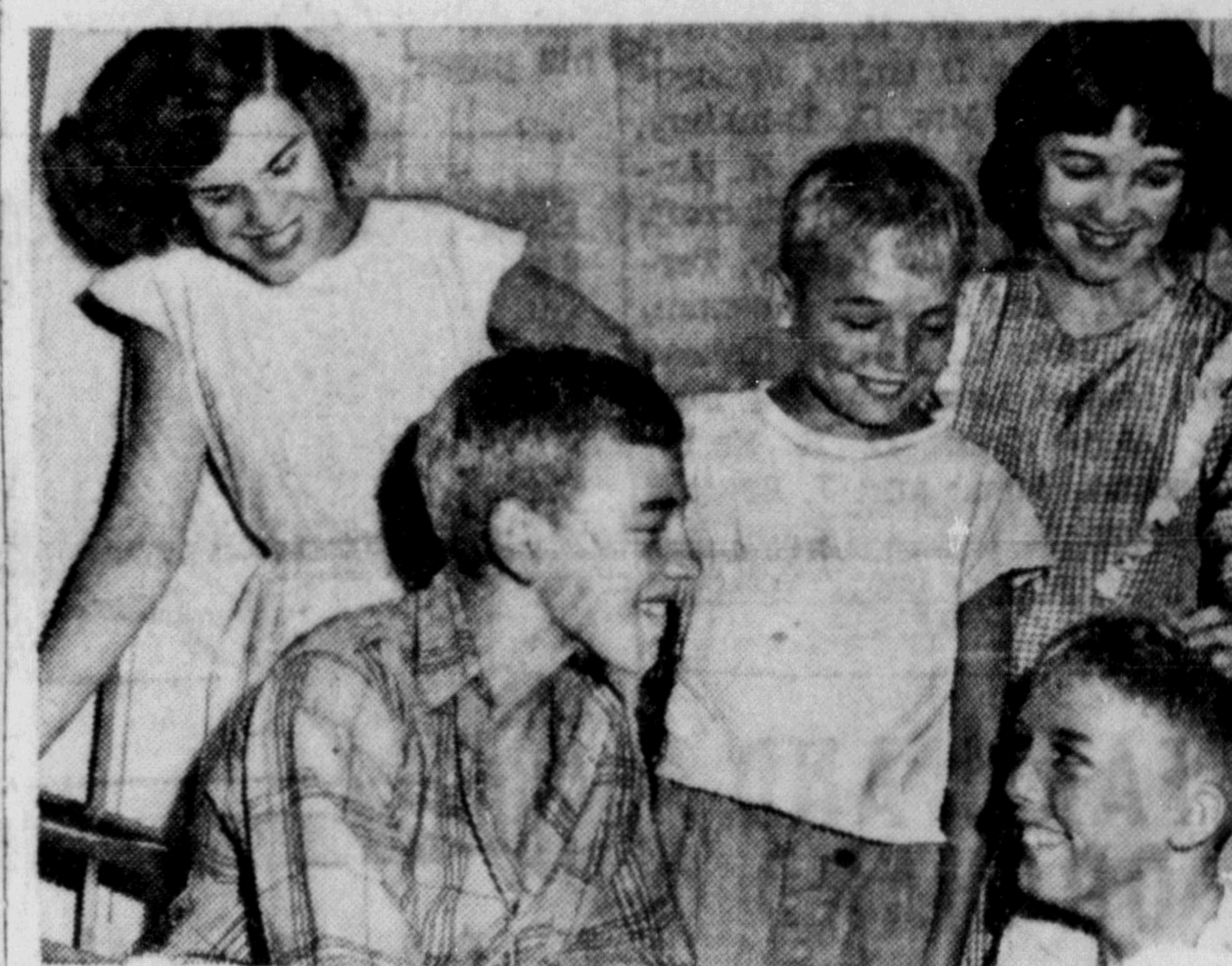
LONDON BOYS SPORT GREEN HAIR —These London, Ont., boys are the centre of interest as they show the latest thing in juvenile coiffures—green hair. The coloring occurred accidentally in the city's swimming pool. To remove algae from the floors of the tanks, copper batusim is dissolved into the water. Too much was added. Result: green hair.

D. K. West, of the Silver Standard Mine at New Hazelton, was a passenger to Vancouver on today's plane.