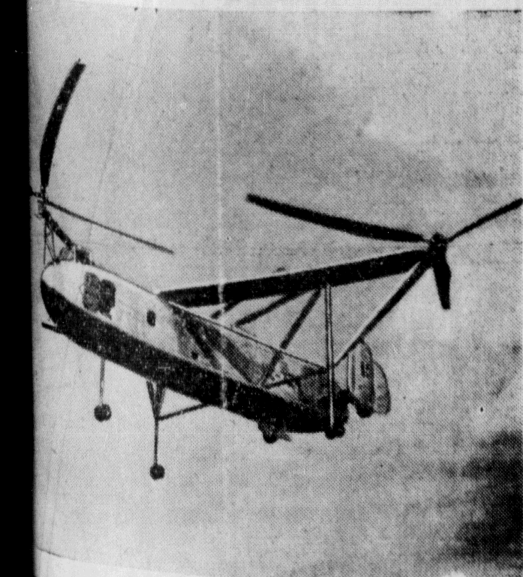
"AIR HORSE" —One of the most unusual exhibits at the British Aircraft Constructors' Show in Farnborough, is the "Air Horse," a 24-seater helicopter, shown in flight. The strange-looking helicopter has a single engine and is powered by one engine.