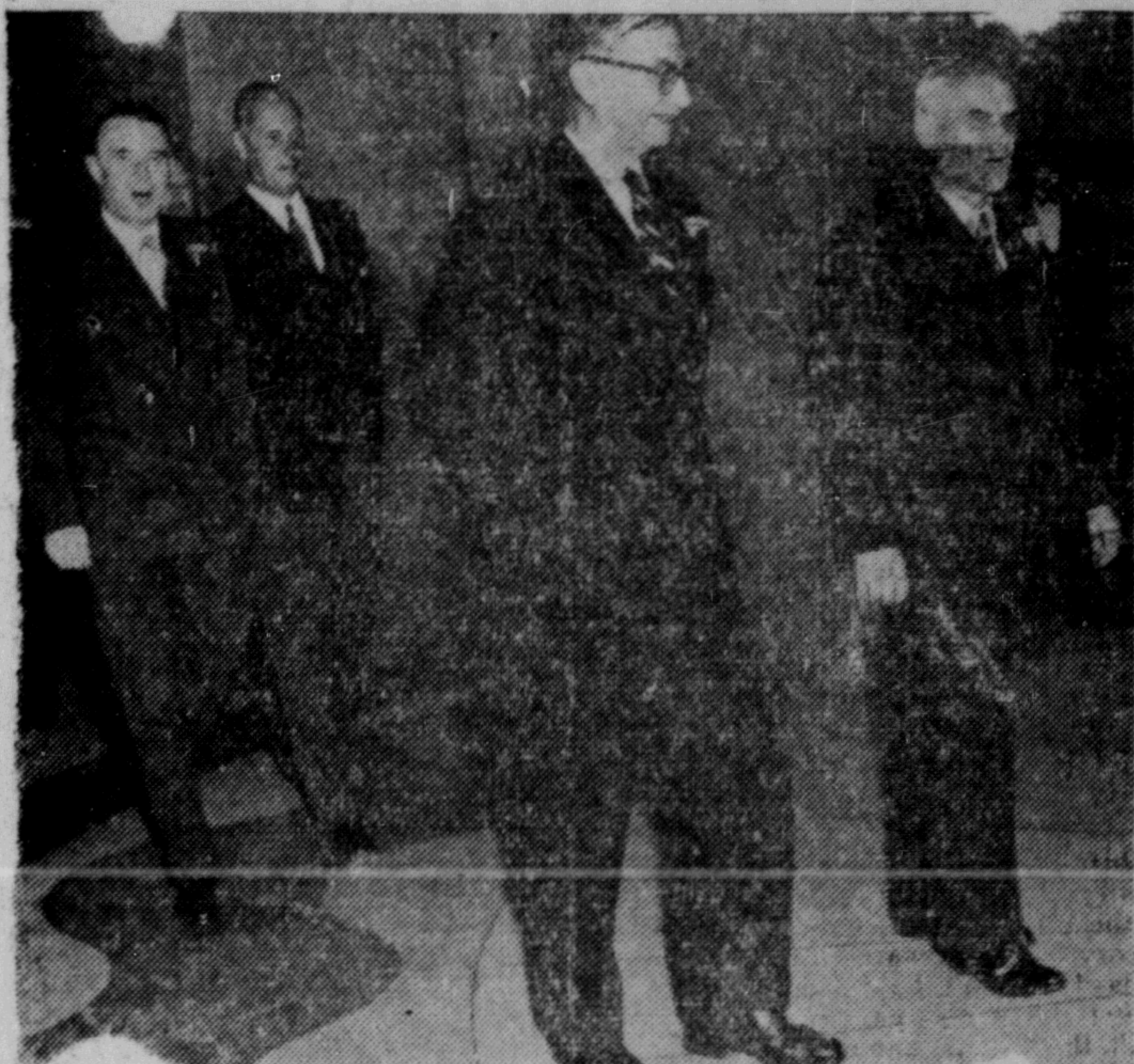
CANADA'S 21ST PARLIAMENT OPENS —Hon. J. D. Howe, Defence Minister Claxton, Finance Minister Abbott and Opposition Leader Drew enter Ottawa's House of Commons at the opening of parliamentary sessions. Expected to sit for 10 weeks, parliament's problems include amendments to eliminate the Privy Council as Canada's last court of appeal, enlargement of the scope of the National Housing Act, and arrangements for a convention of provincial premiers immediately after the session's end.