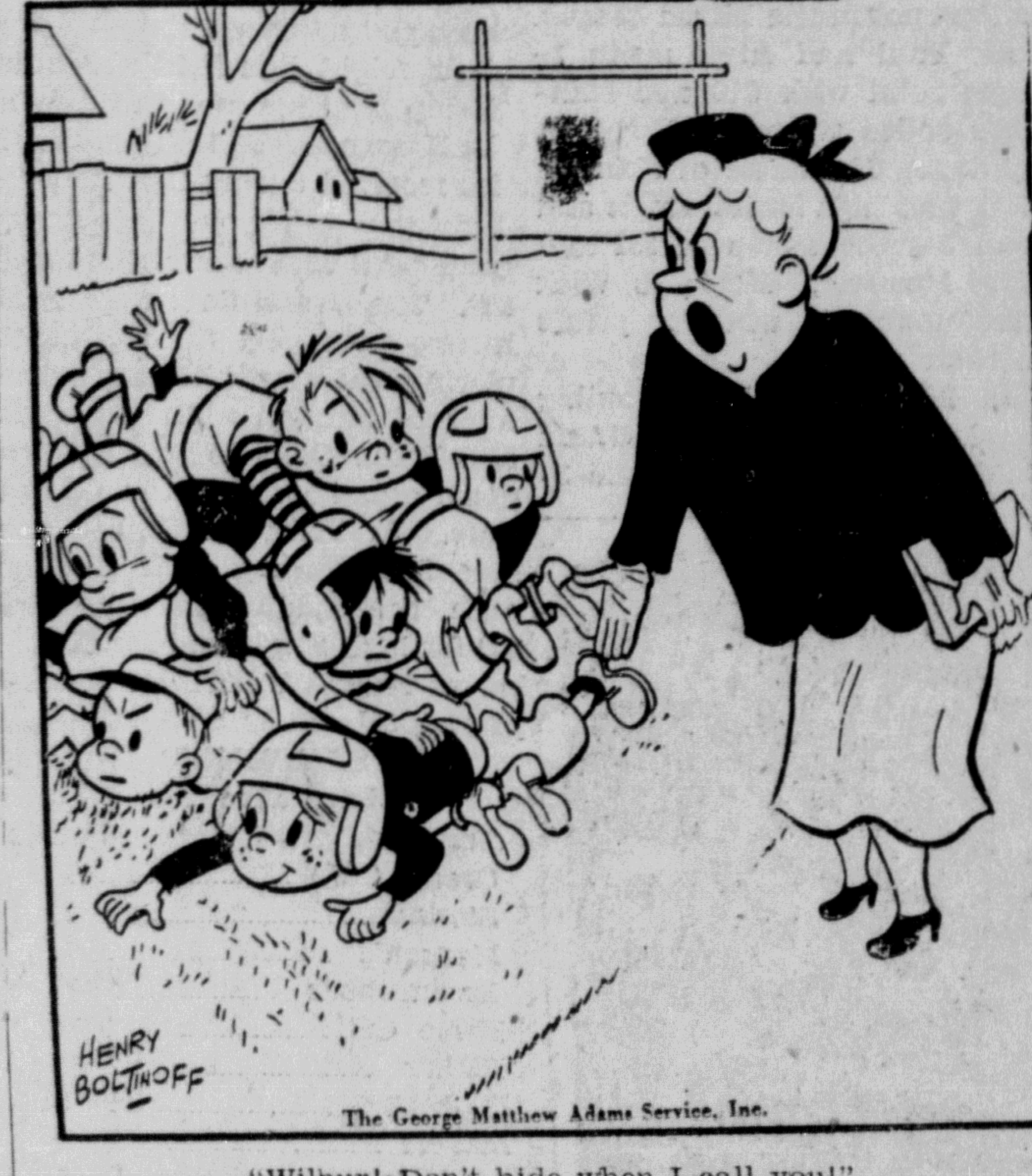
The George Matthew Adams Service, Inc.

CLASSIFIED ADVERTISING IN THE DAILY NEWS PAYS!