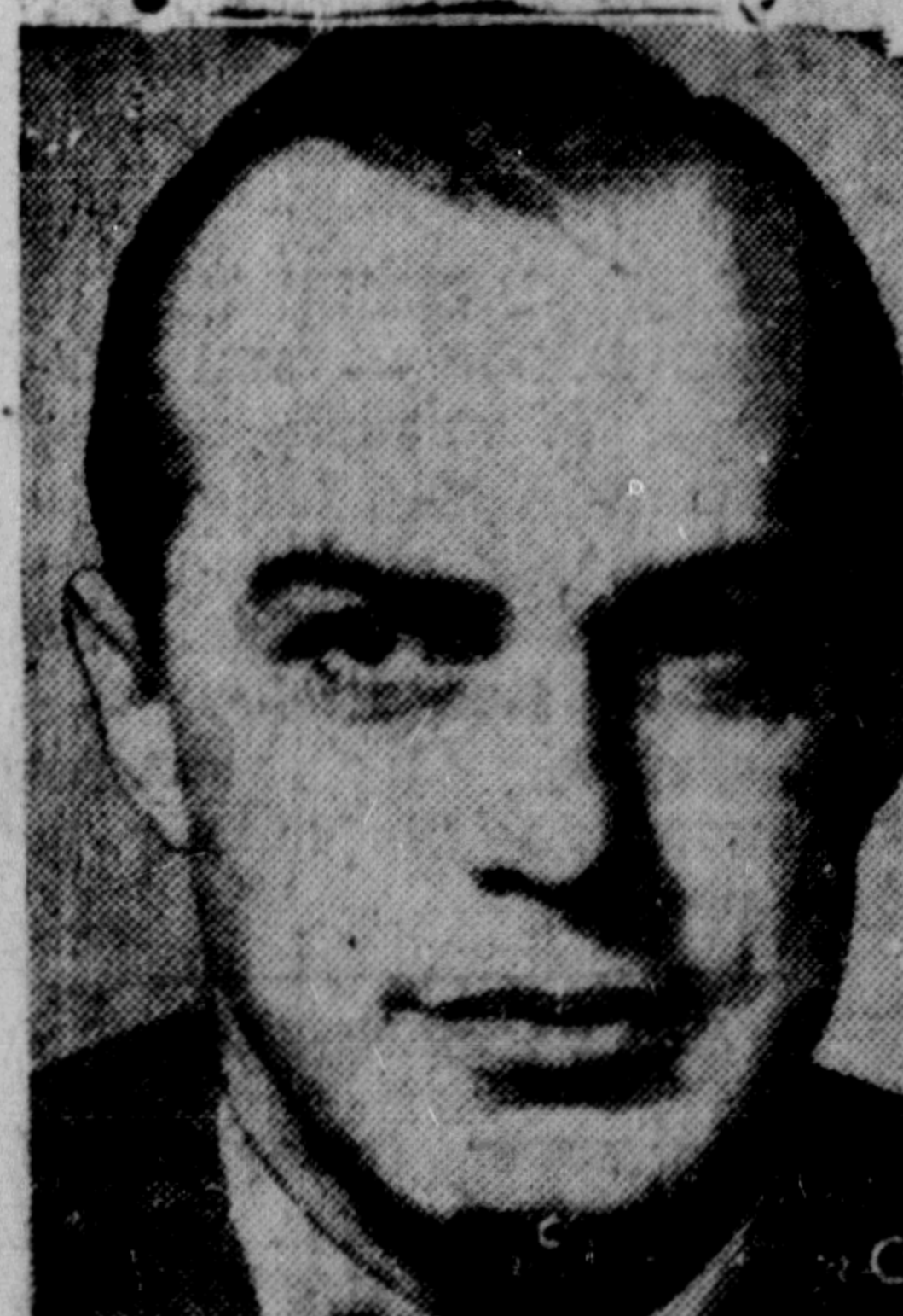
P.C. REPRESENTATIVE—Born Oct. 13, 1917, at Three Rivers, Que., Leon Balcer now sits in the House of Commons as Progressive Conservative member for the Quebec constituency of Trois-Rivieres. He entered politics after serving four years in the Royal Canadian Navy during the Second World War. He was elected president of the Young Progressive Conservative Association of Canada this year.