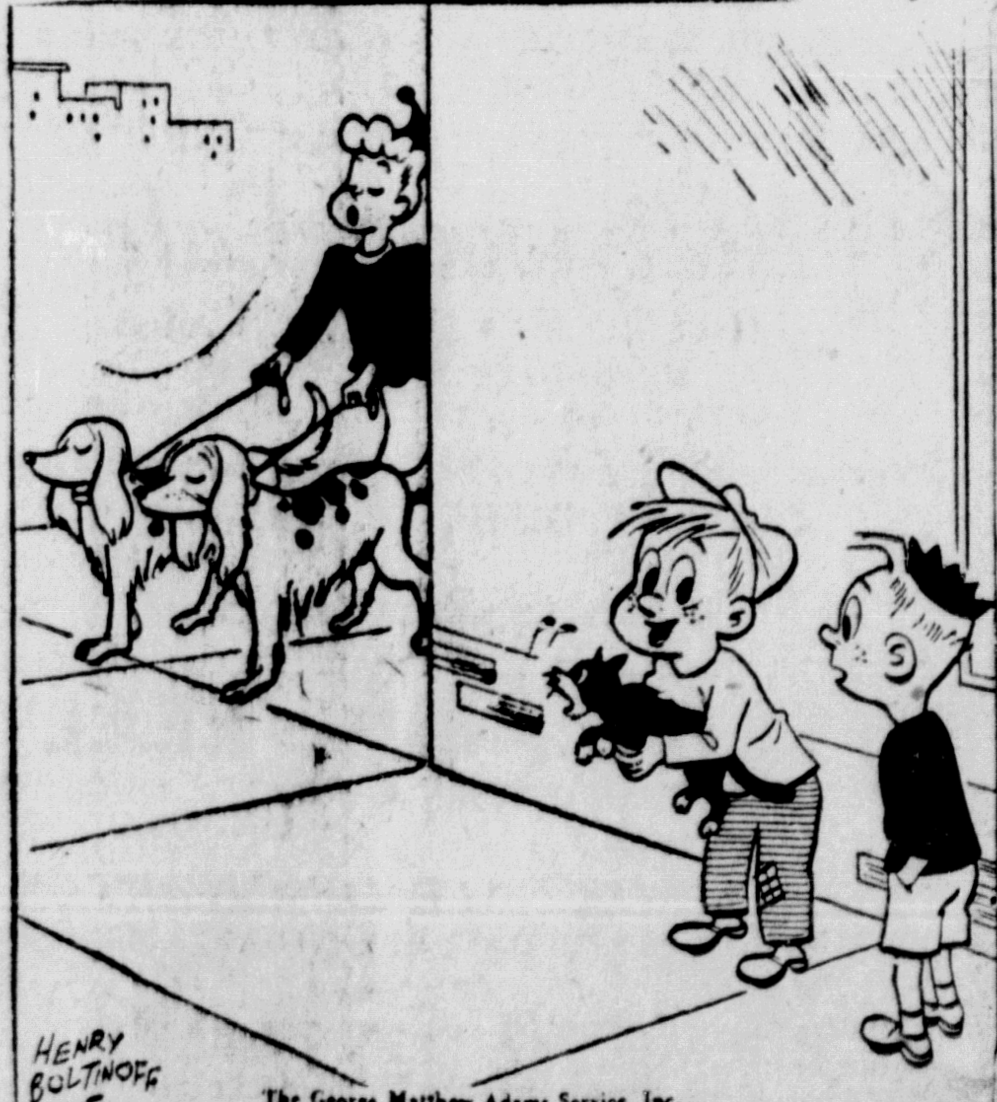
"Wanna see some fun?"