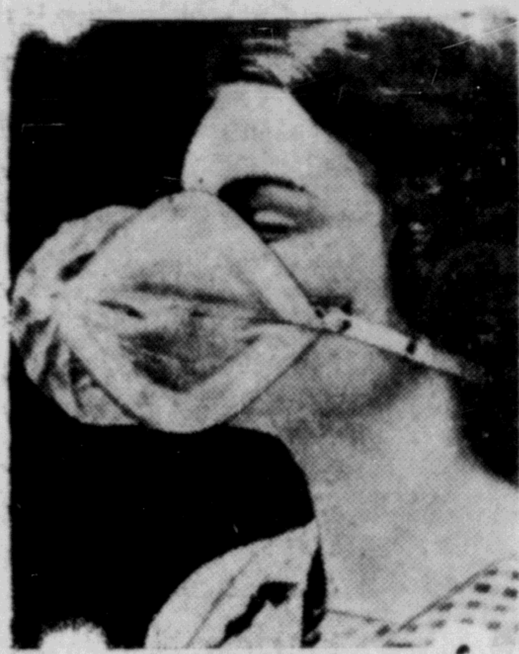
NOT MADE FOR BEAUTY—

cent Sunday. The concession booth was emptied of ice cream, pop and hot dogs.