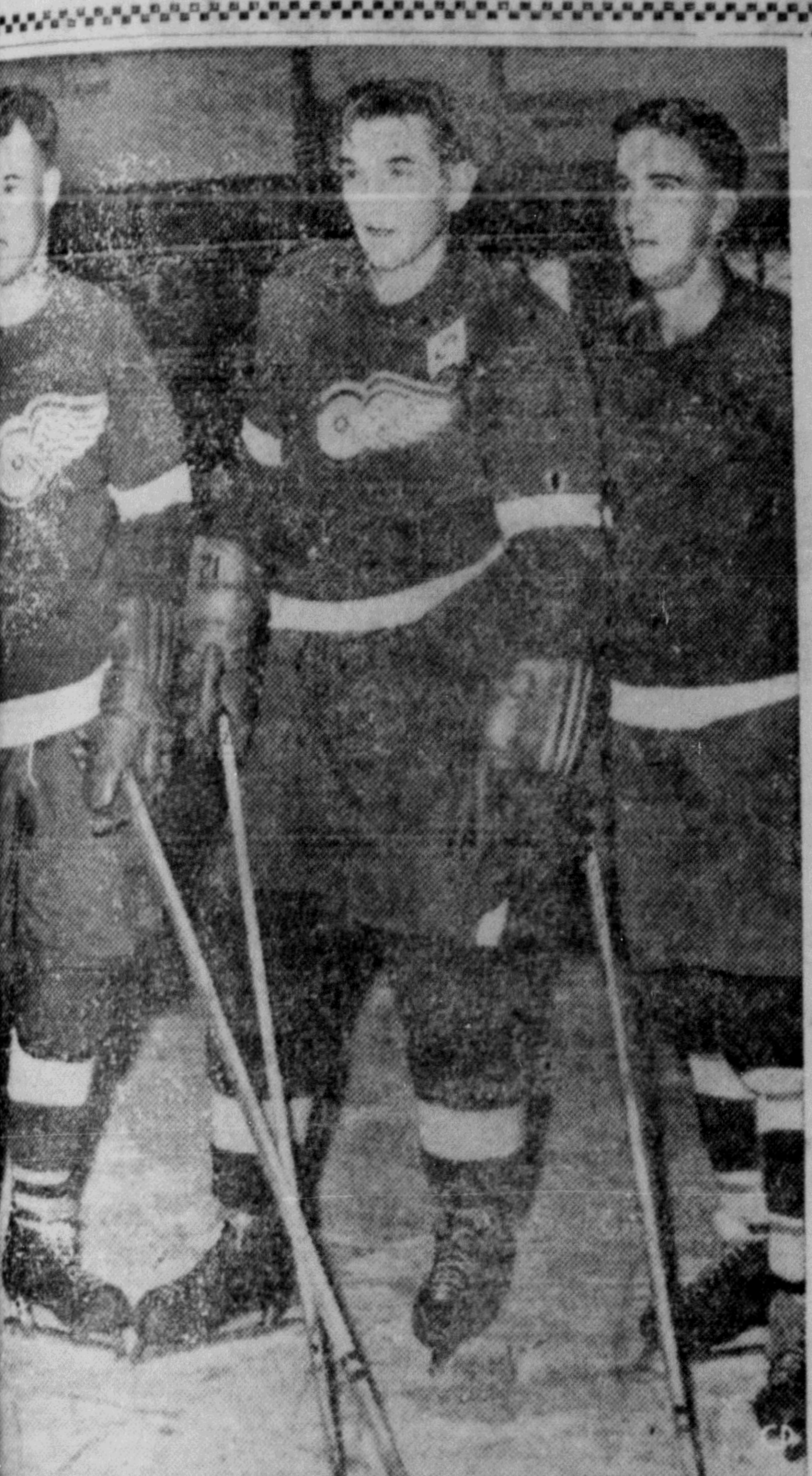
IN ACTION—Back in action following his injury suffered during Stanley Cup playoffs against Toronto Maple Leafs last night winger Gordie Howe, left, is shown with line mates at centre, and Ted Lindsay following a pre-season work-out with the Detroit Red Wings' Sault Ste. Marie, Mich., training camp. Howe appears to bear no ill-effects from the injury.