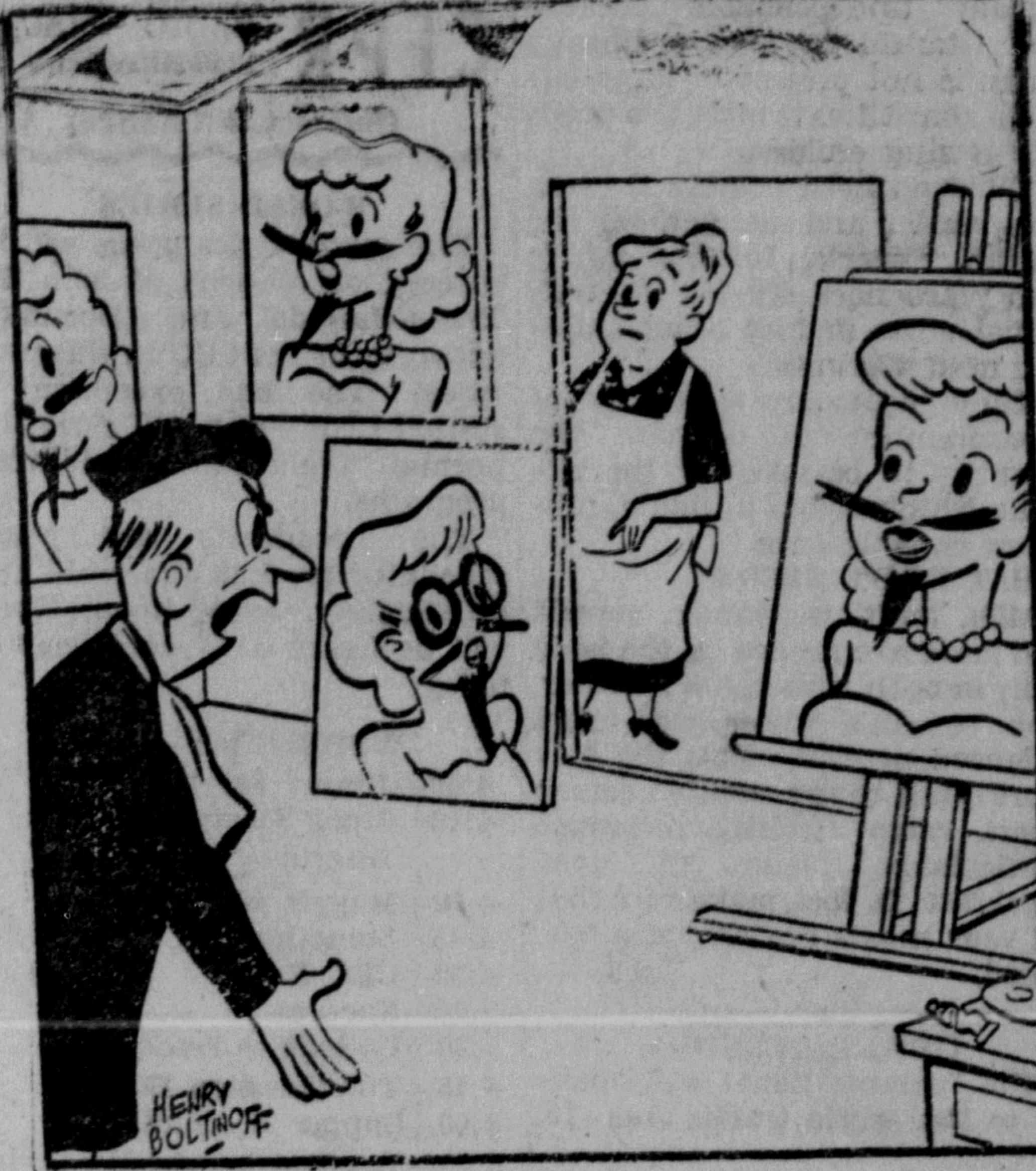
"I see that good-for-nothing brother of yours was here today!"