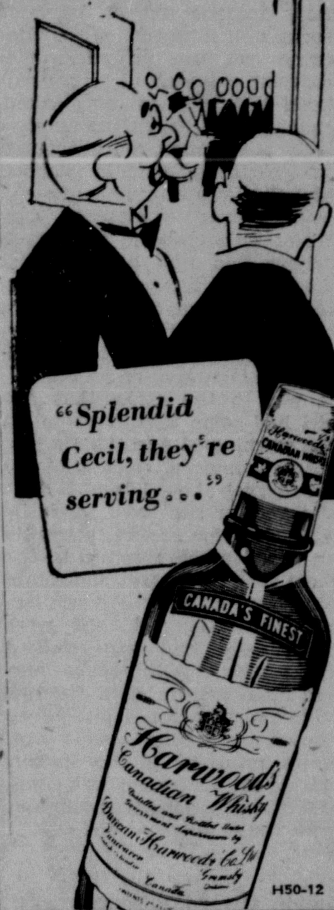
This advertisement is not published or displayed by the Liquor Control Board or by the Government of British Columbia