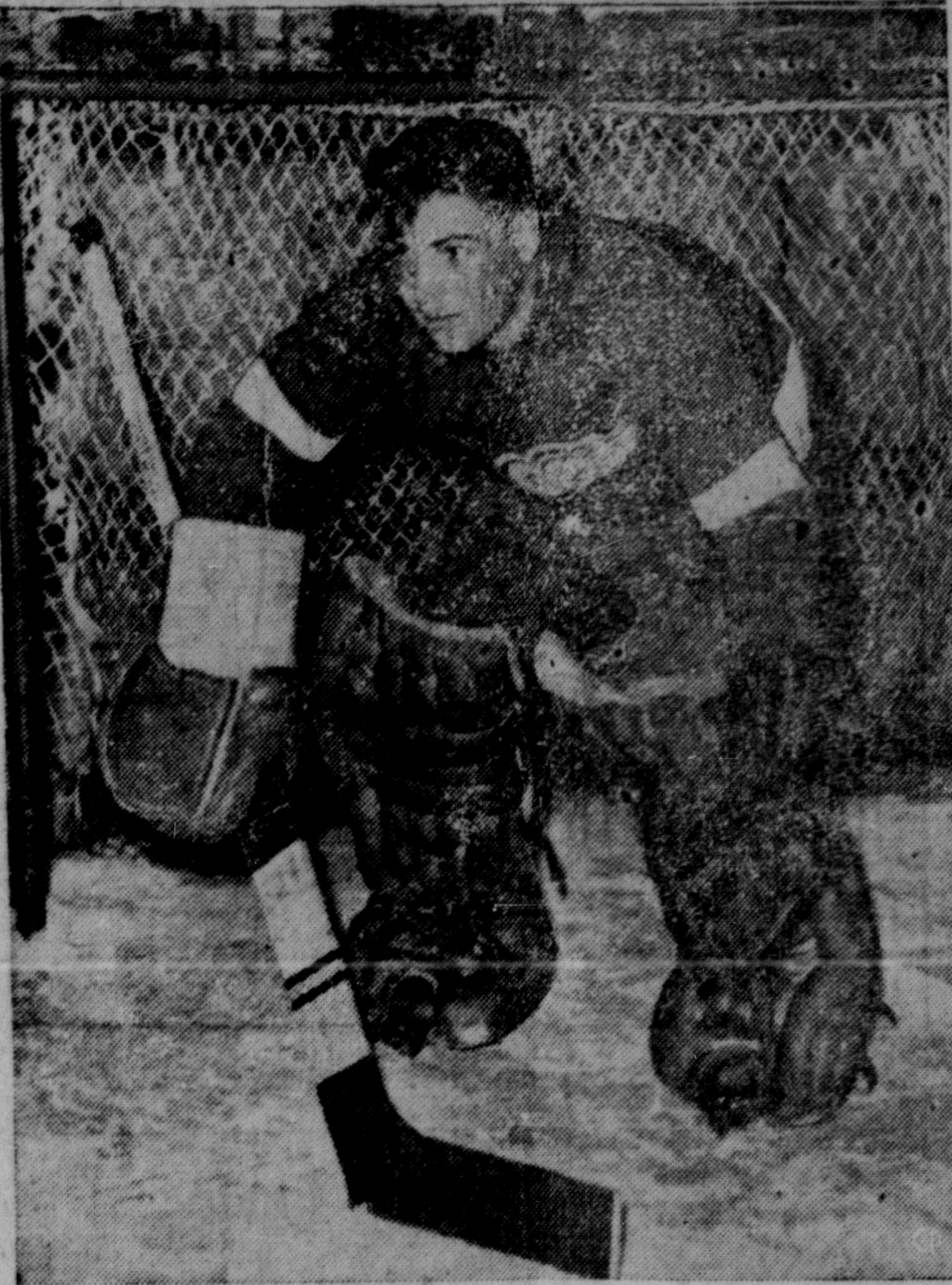
LUMLEY'S SUCCESSOR—Guarding the net this year for the Detroit Red Wings, last year's Stanley Cup winners, is young Harry Sawchuk. In pre-season training at Sault Ste. Marie, Mich., his performance has been nothing short of sensational. The fast-moving net-minder will fill the shoes of Harry Lumley, traded to the Black Hawks in a major player deal following the end of the 1949-50 season.