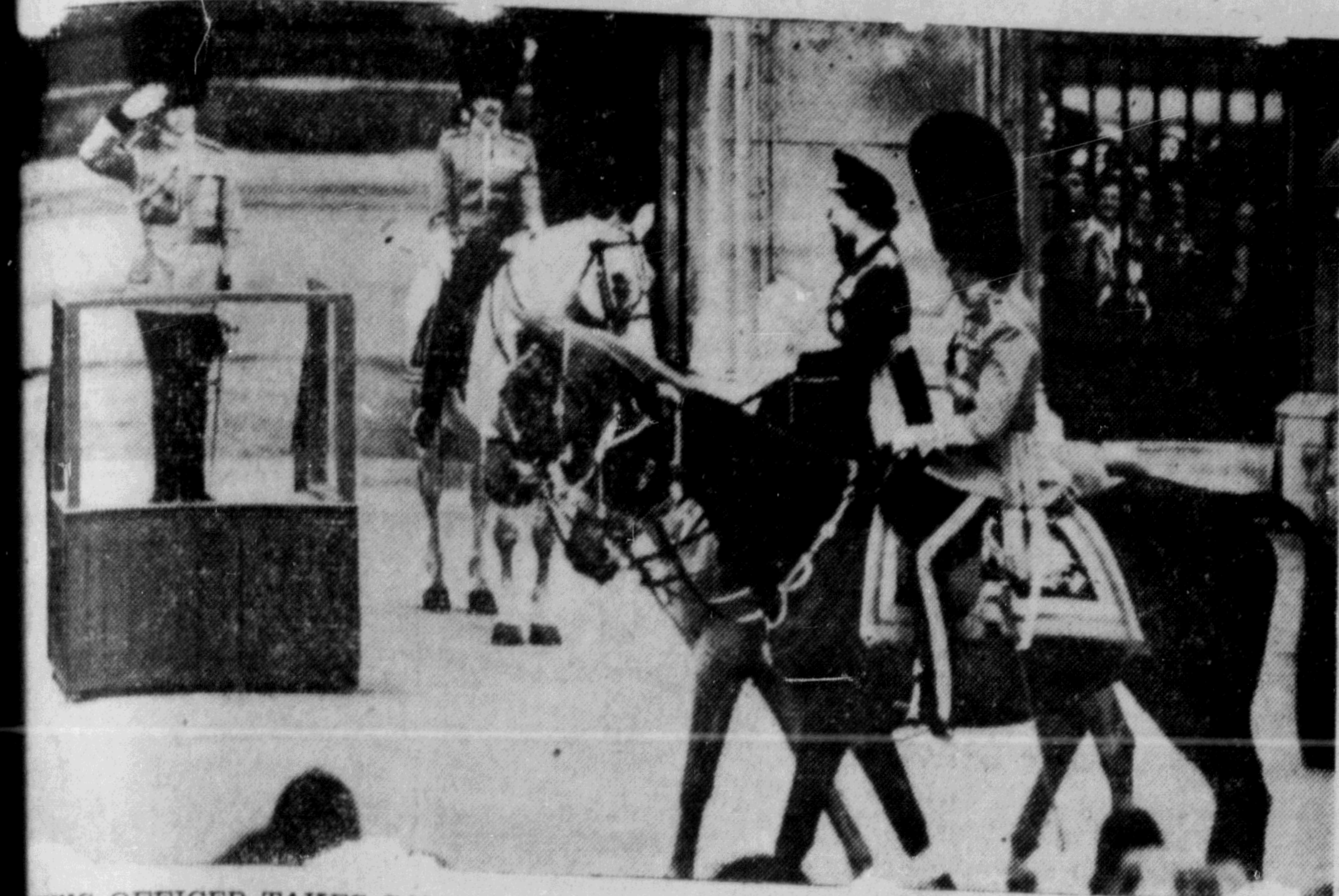
KING OFFICER TAKES SALUTE OF PRINCESS ELIZABETH —White-gloved hand to bearing-busby. King George takes the salute from his daughter, Princess Elizabeth, at Buckingham Guards, rides with her uncle, the Duke of Gloucester, who is colonel of the Scots Guards, the head of the Guards parade. The colorful ceremony was staged in honor of King's birthday, which, actually, is in December but observed in June because of the better weather.