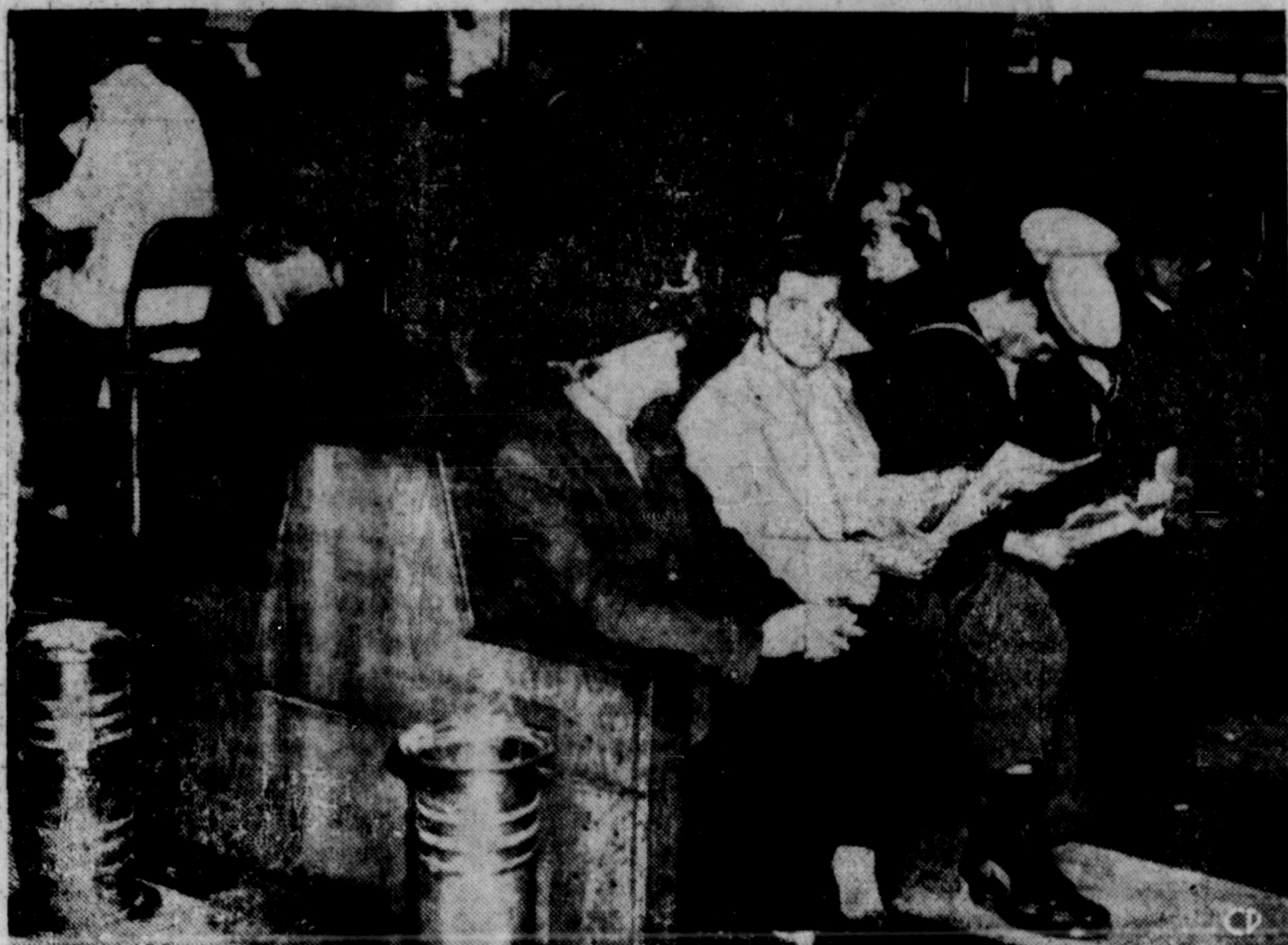
LONG WAIT —Weary travellers wait for precious bus transportation at Montreal after Canada's railways were crippled by the strike of 124,000 non-operating employees. Buses were overtaxed and passengers were forced to wait several hours before leaving the terminal.

Malaya supplies one-third of the world's natural rubber and one-half of the world's tin.