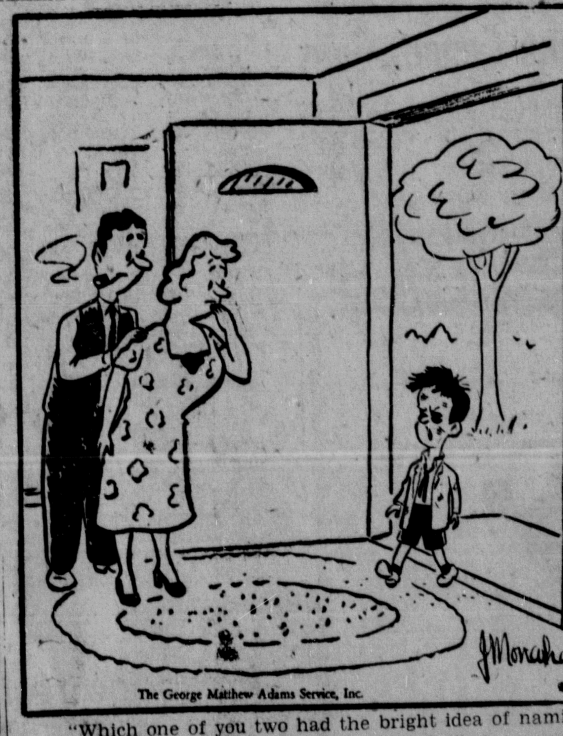
The George Matthew Adams Service, Inc.

"Which one of you two had the bright idea of naming me Jack Dempsey Goliath?"