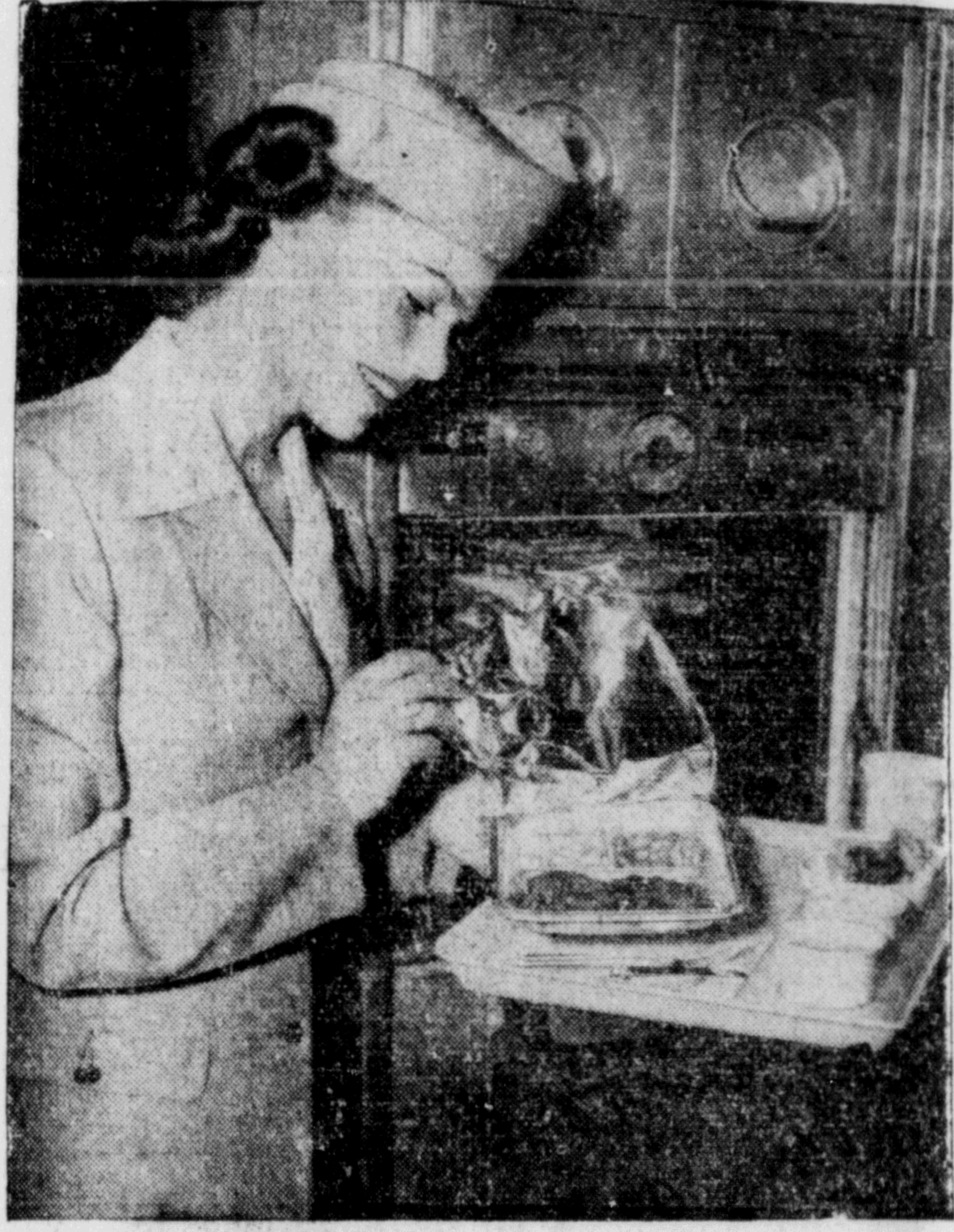
MEALS IN AIR—This pretty hostess, thousands of feet up in a modern airliner, has the knack of serving delicious meals at a moment's notice. Anything from chicken a la maryland to filet mignon is prepared on the ground, by expert chefs, sealed in aluminum foil, deep-frozen and reheated aloft.