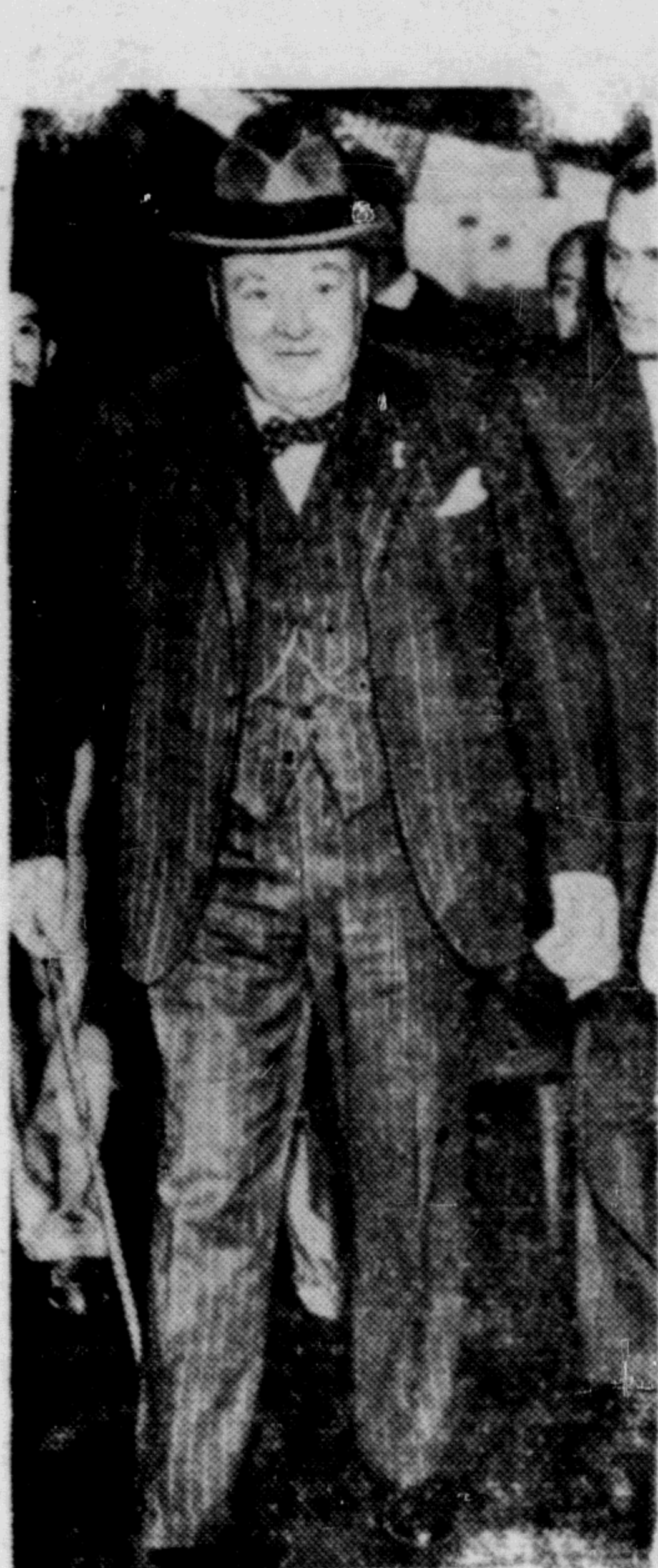
CHURCHILL IN PARIS—Former Prime Minister of Great Britain Winston Churchill is pictured as he changed trains in the railroad station in Paris. He is en route to Aix-en-Provence for a brief vacation.