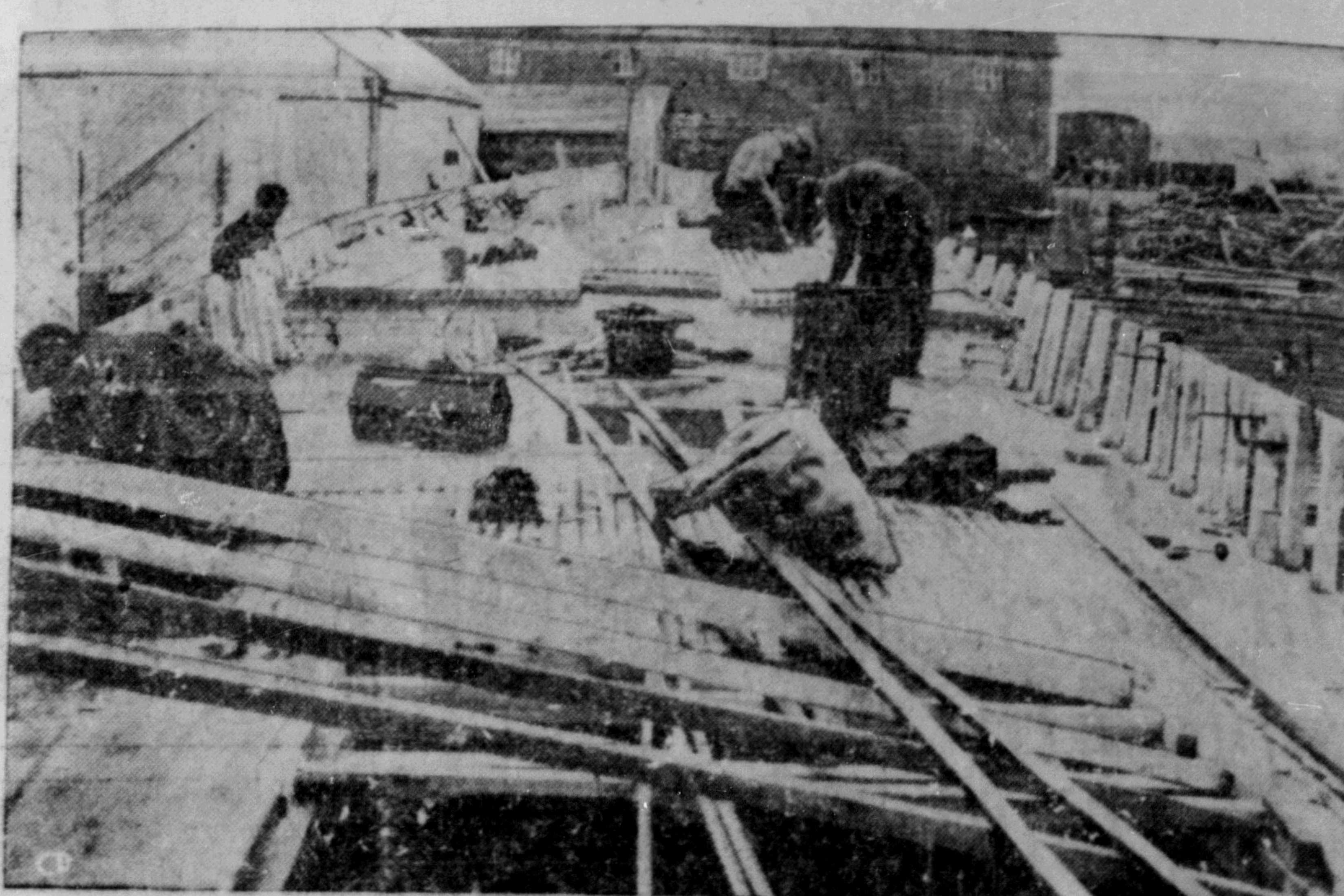
"LUKIE'S BOAT"—Shipbuilders in the yards at Clarenville, Nfld., work on a new-type fishing boat. Construction of the vessel is part of a drive for modernization of the province's fishing industry. Unofficially called "Lukie's Boat"—the name of an island folk song—she is modelled on the Norwegian-type fishing boats and is intended for use in comparatively rough waters.