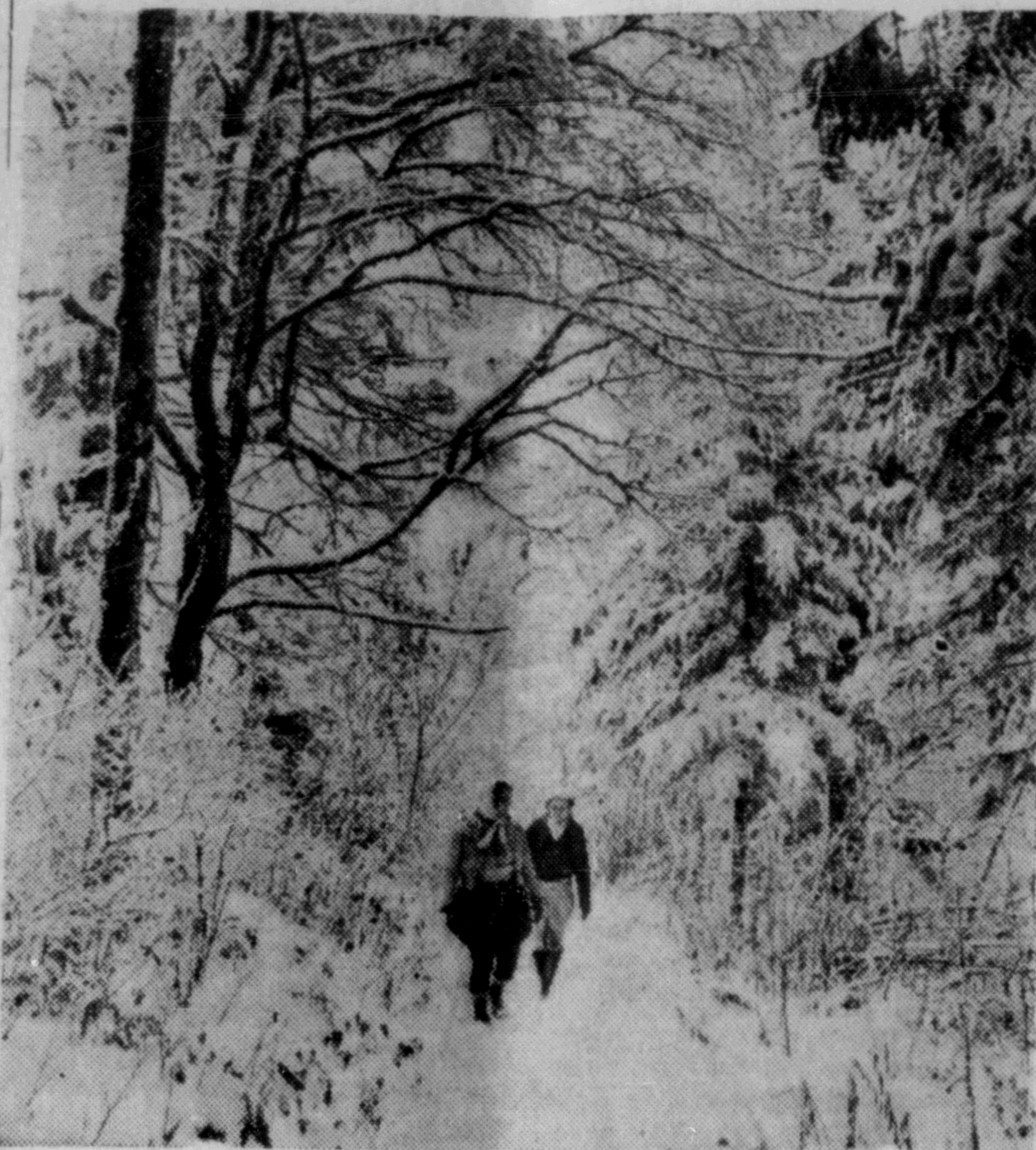
MOTHER NATURE HAS LAST FLING AT WINTER — With spring beginning officially on March 21, Mother Nature had a last fling and blanketed eastern Canada with its heaviest snowfall of the season. Scenes like this one were not uncommon in the east. Traffic was turned into a caterpillar procession but no serious accidents were reported.

A little early work with the spudder and regular cutting with the lawn mower will help. Then there are the new 2-4-D well-formed buds. The roots should be protected from the air carefully according to directions and be moist or wet, and it is