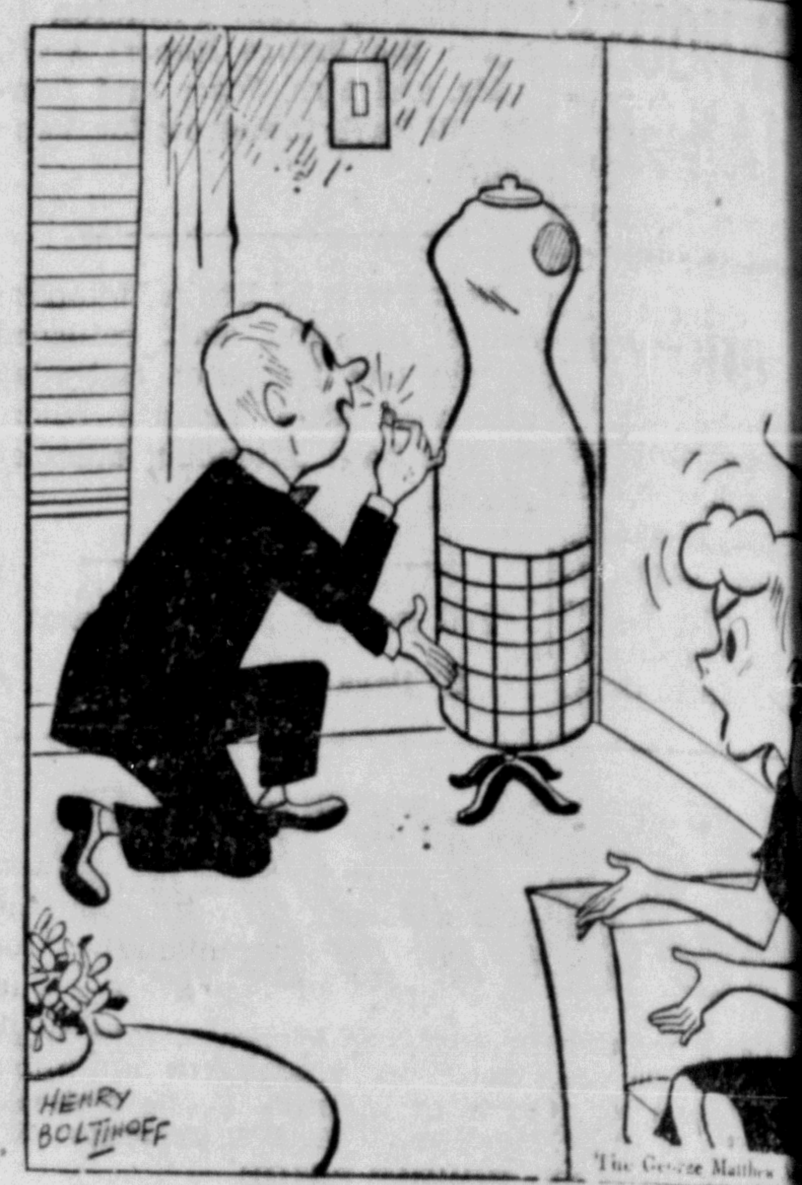
For the last time—I'll never marry you till you go.