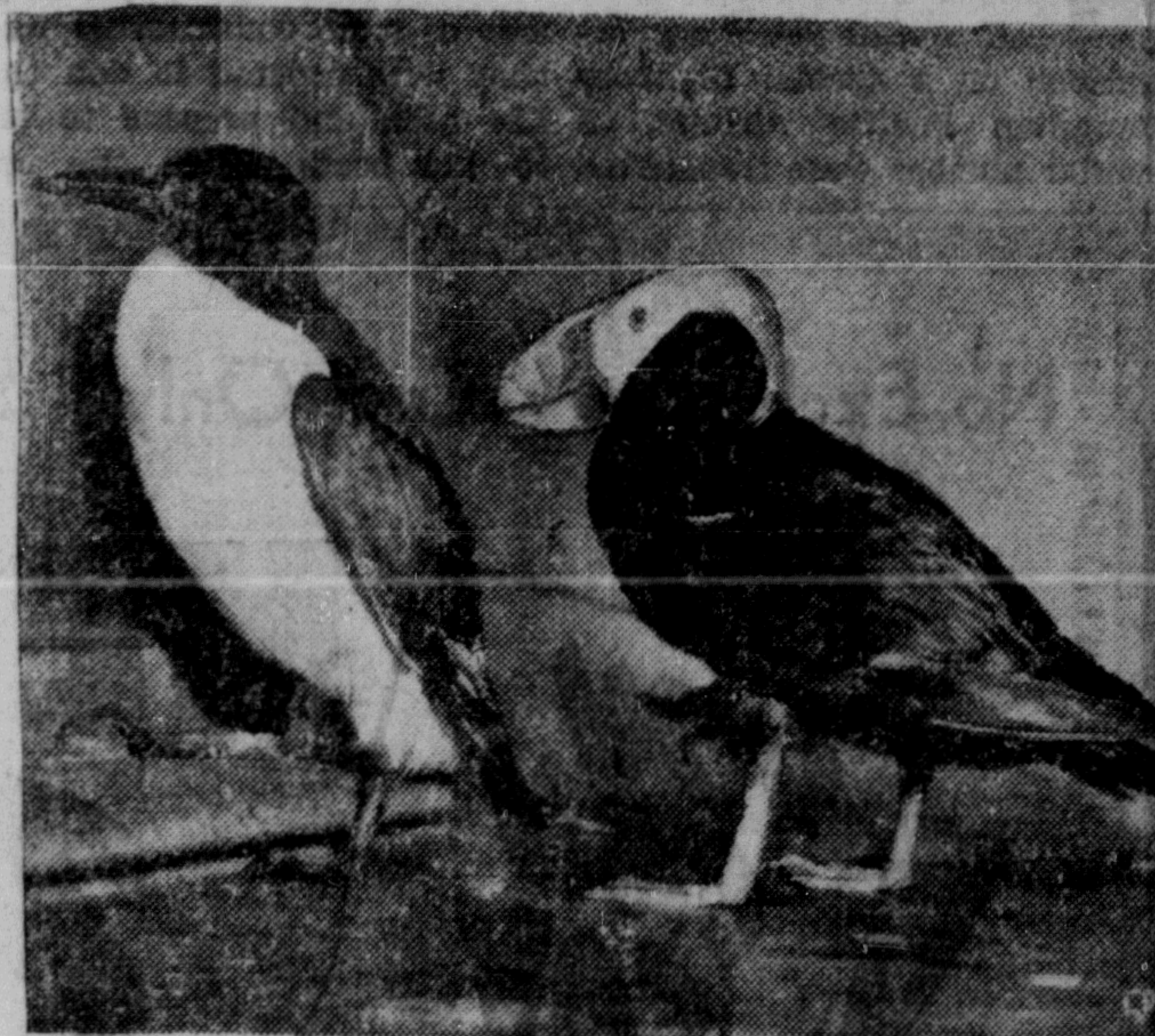
THEY'RE CANADIANS, TOO —Captured on stormy Triangle Island, 30 miles northwest of Vancouver Island, these weird British Columbians will make their new home in Vancouver's Stanley Park Zoo. Provincial museum scientists, visiting the island to find new zoo specimens, came up with a Pacific murrelet, left, and a tufted puffin.