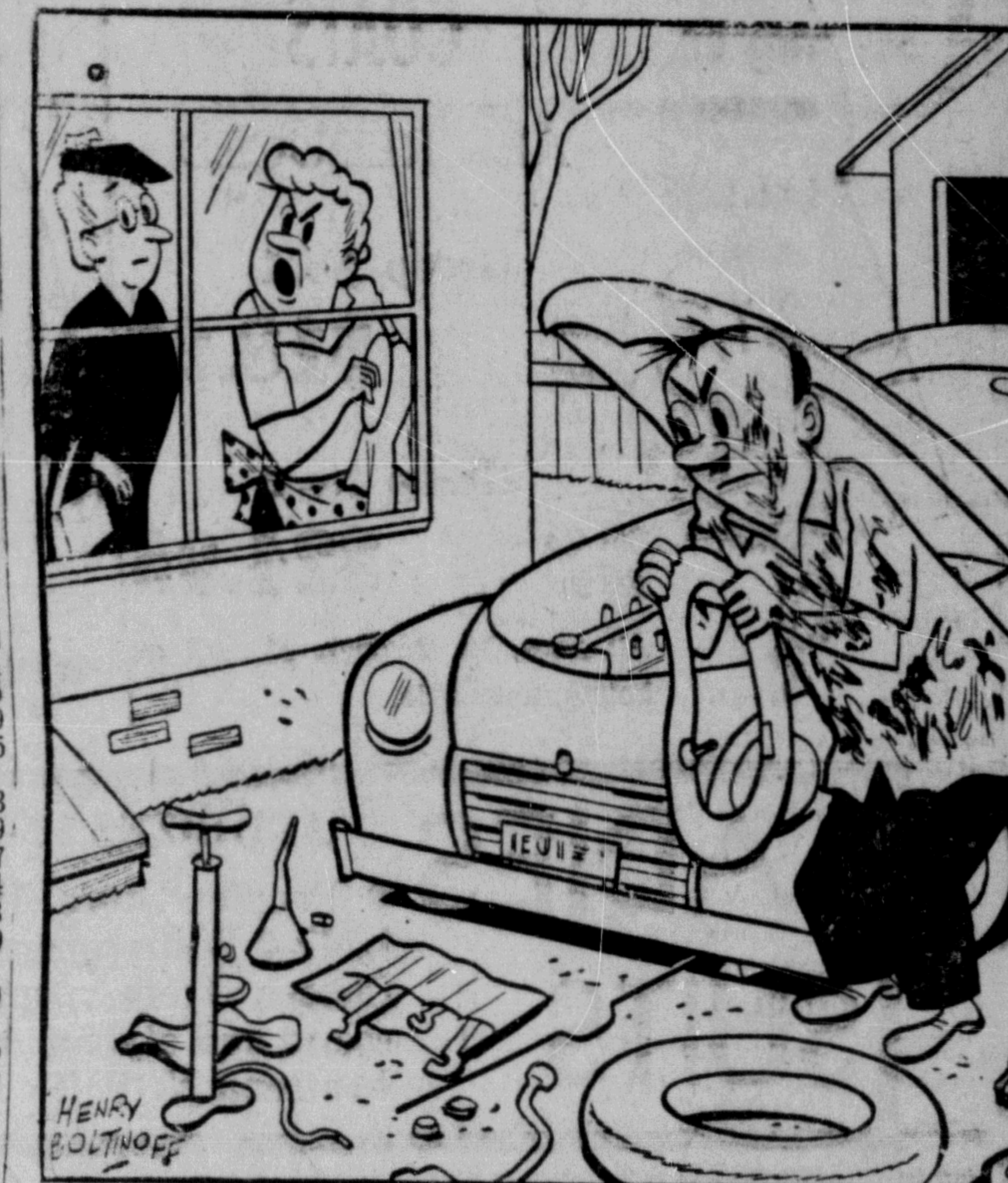
"Harvey will do anything just to get out of doing the dinner dishes!"