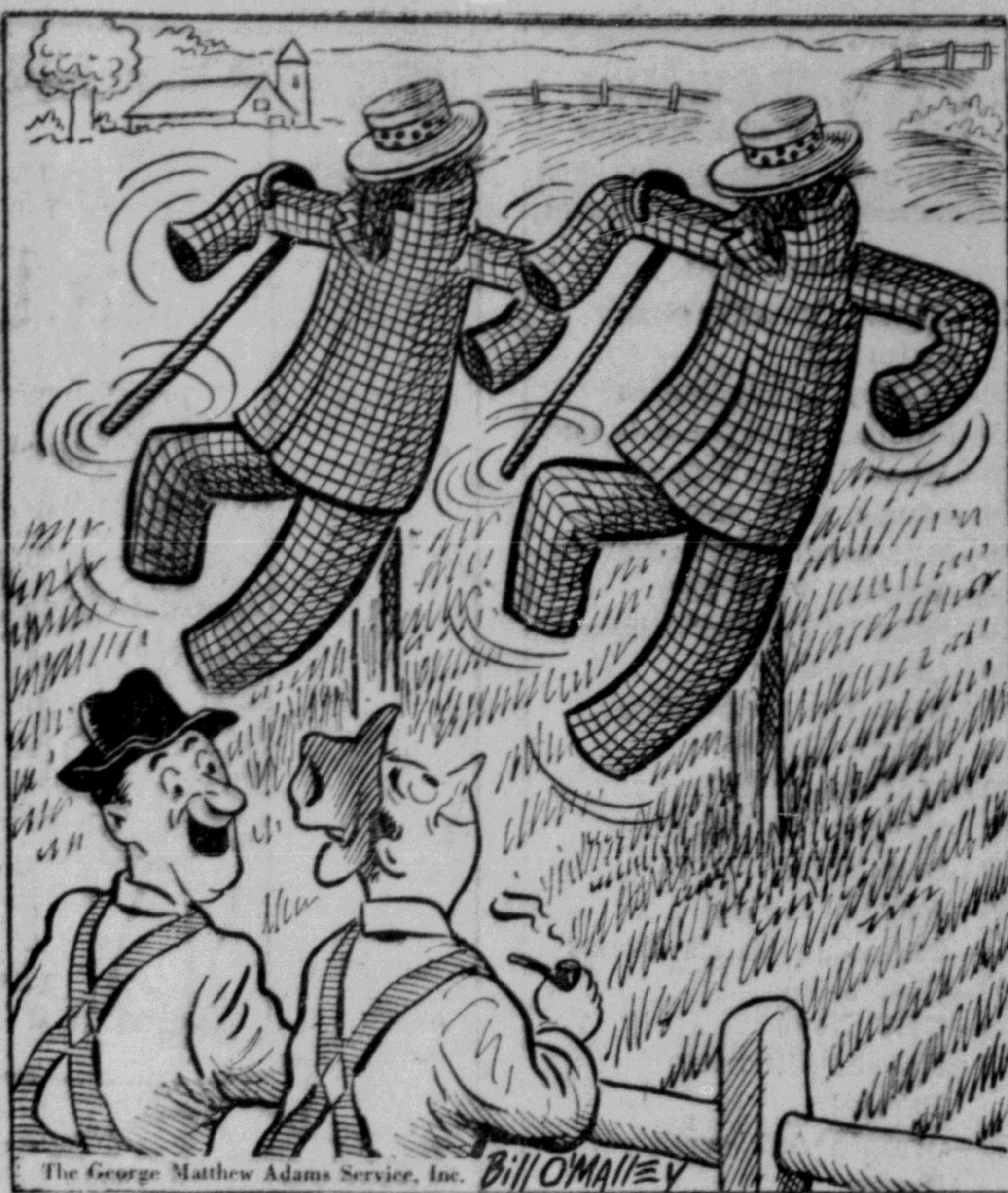
"My new neighbor used to be on the stage."

For Alaska Wednesday—ss. Prince George, midnight. Nov. 2—Princess Louise, a.m. Nov. 14—Princess Norah, a.m. Nov. 25—Princess Norah, a.m.