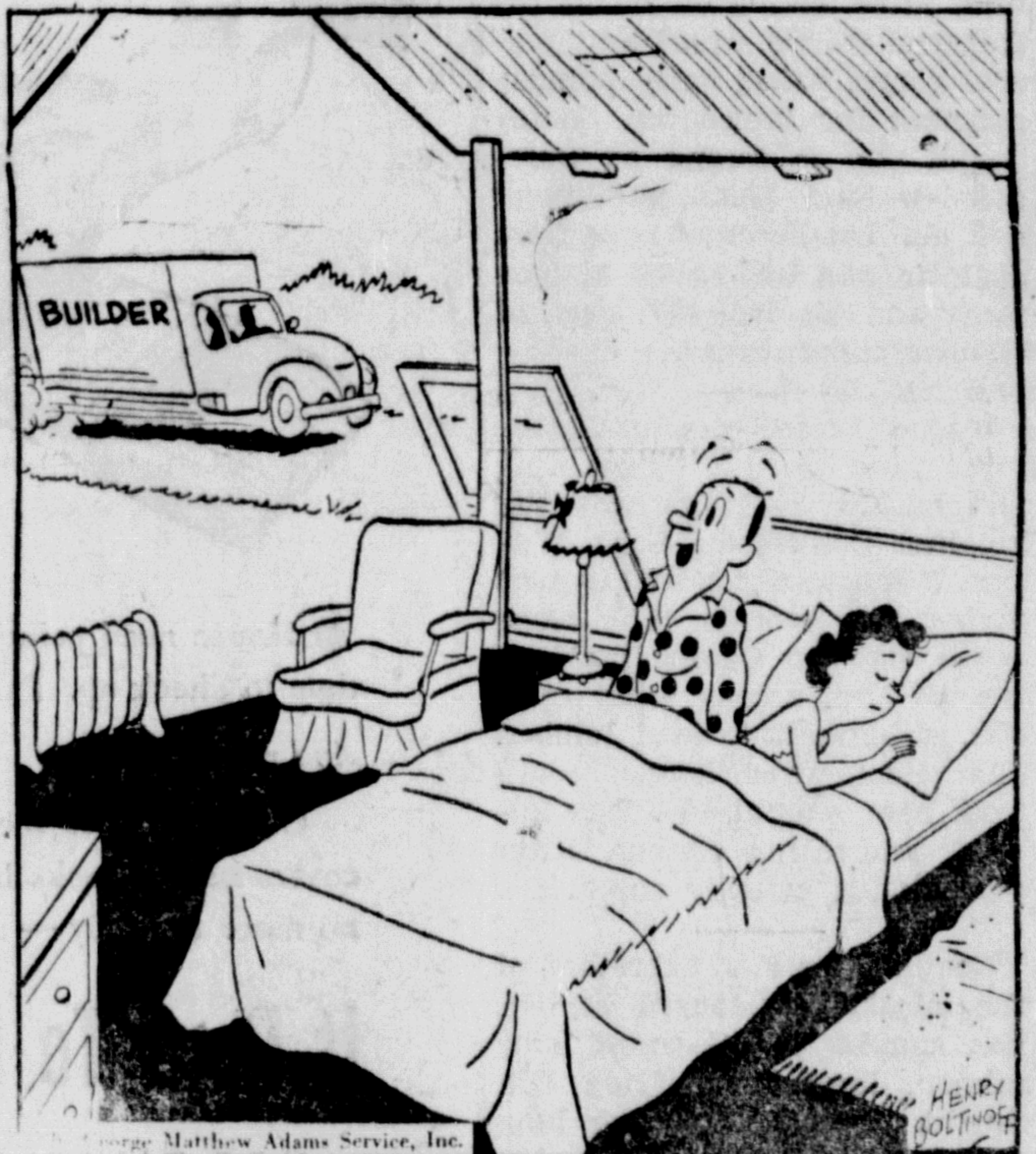
George Matthew Adams Service, Inc.