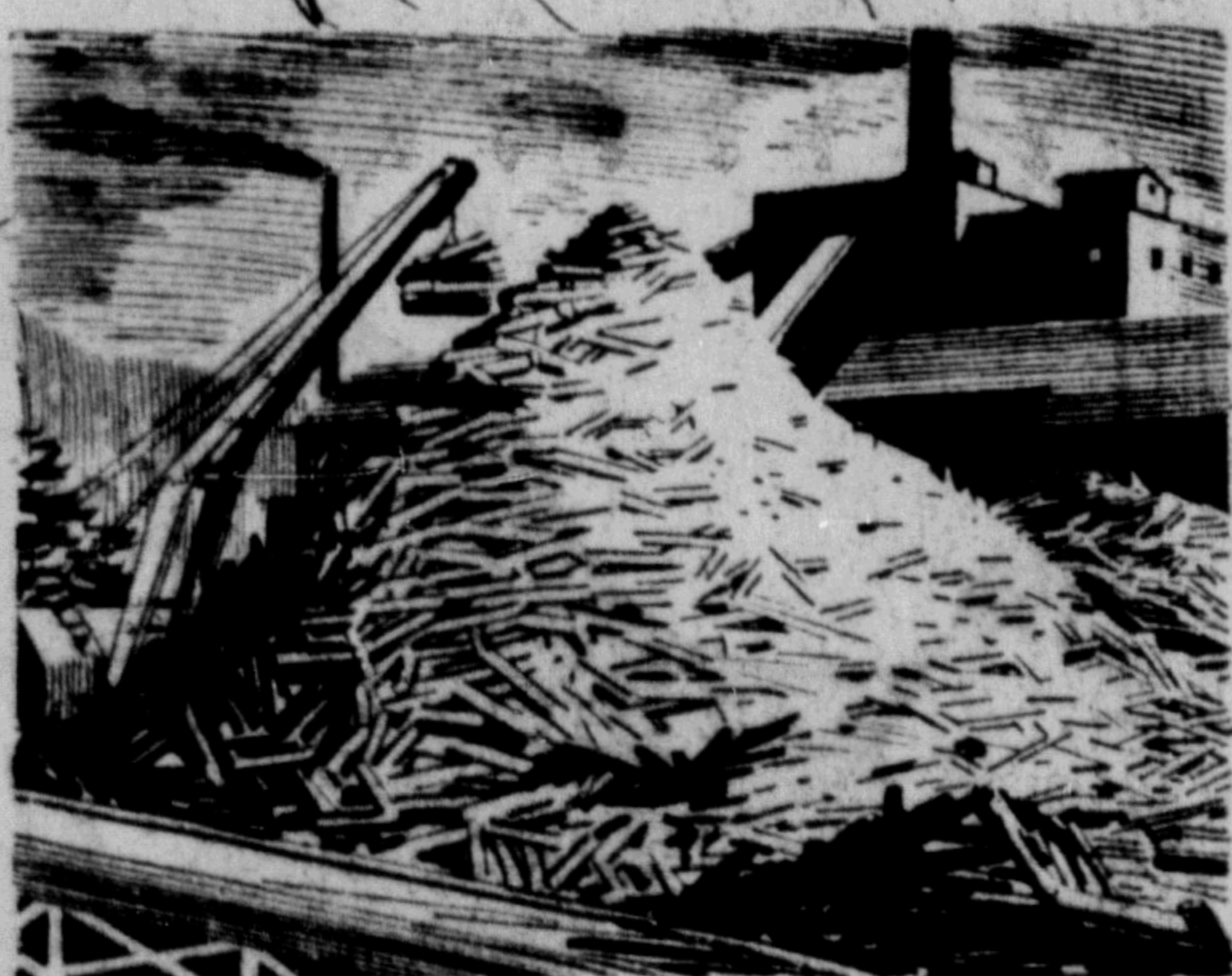
To turn this pile of logs into tomorrow's newspapers, rugged machinery will be used—also acids and other corrosive chemicals. That's why so much equipment in pulp and paper plants is made of Nickel and Nickel alloys.