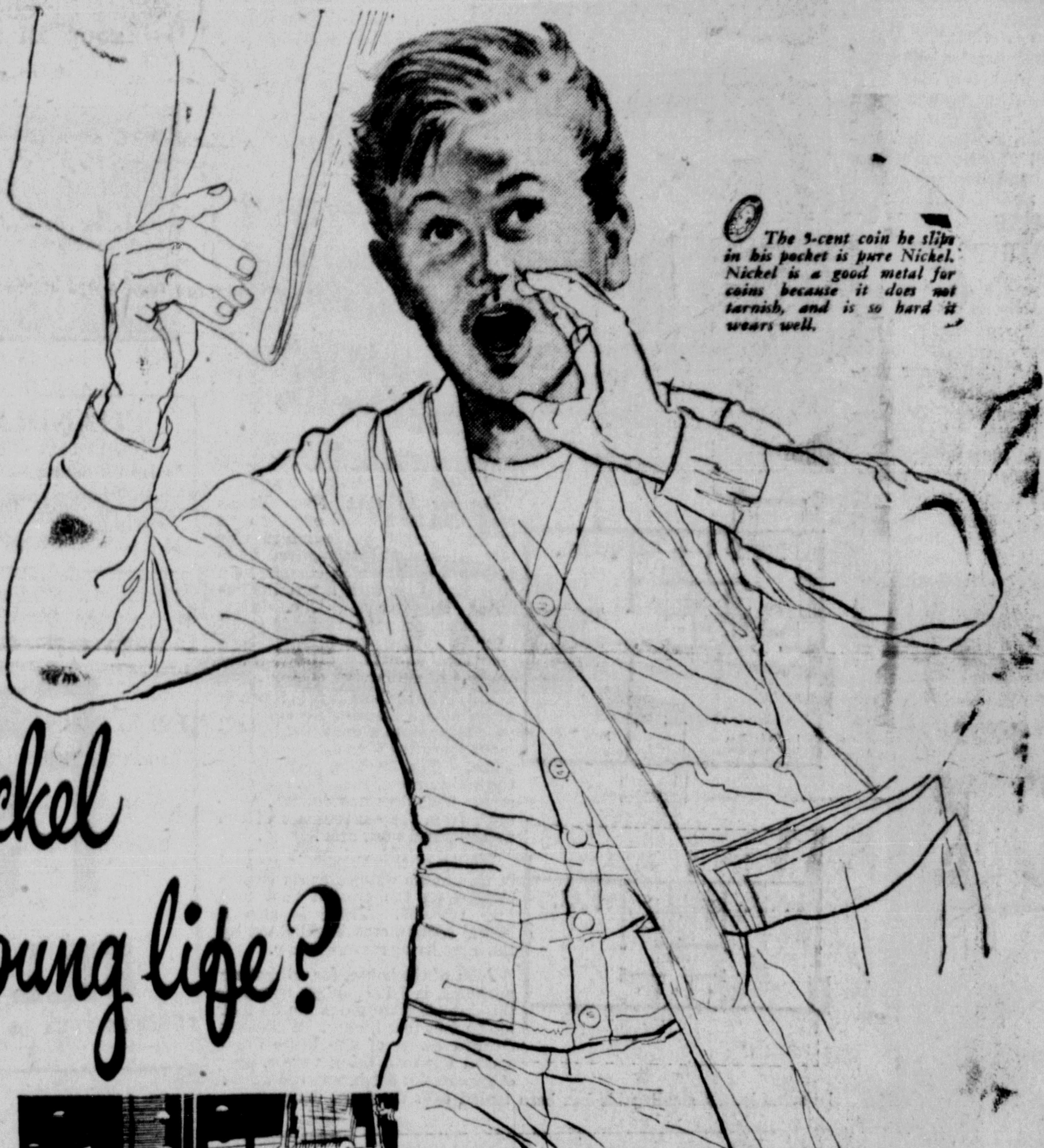
The 5-cent coin he slips in his pocket is pure Nickel. Nickel is a good metal for coins because it does not tarnish, and is so hard it wears well.