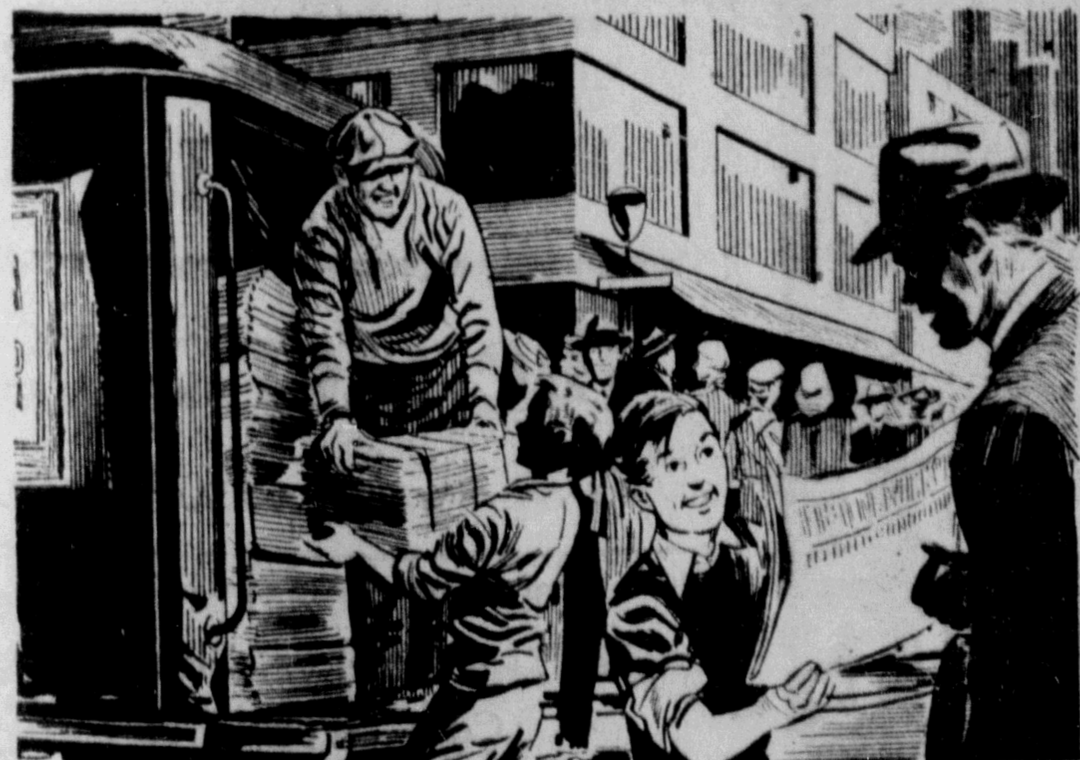
In the trucks, trains and planes which distribute newspapers far and wide, Nickel Steel and other Nickel alloys prevent breakdowns and give long wear.

Forty-three years of research have uncovered hundreds of uses for Nickel in the United States and other countries. Now Nickel exports bring in millions of U.S. dollars yearly. These dollars help pay the wages of the 14,000 Nickel employees in Canada and also help pay Canadian railwaymen, lumbermen, iron and steel workers and other men and women making supplies for the Nickel mines, smelters and refineries