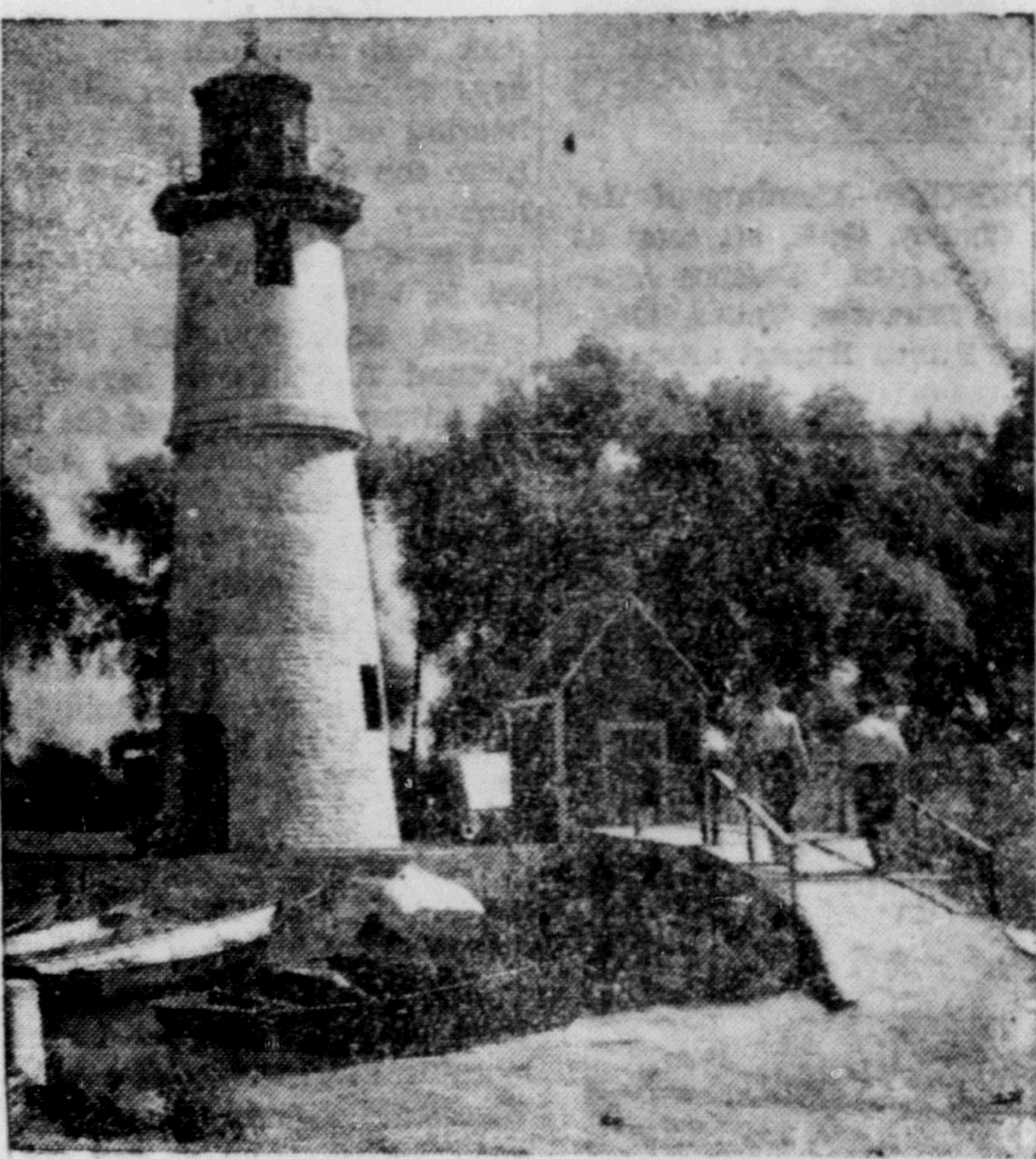
HAVEN FOR HOLIDAYING—Whether it's fishing or boating, or just loafing on a hot summer day, the old lighthouse at Stony Point, Ont., provides the setting. Situated on the shore of Lake St. Clair where the Thames River flows into the lake, the light house has long been recognized as one of the most picturesque spots in Essex County. Built many years ago, the light is a navigation beacon for lake freighters.