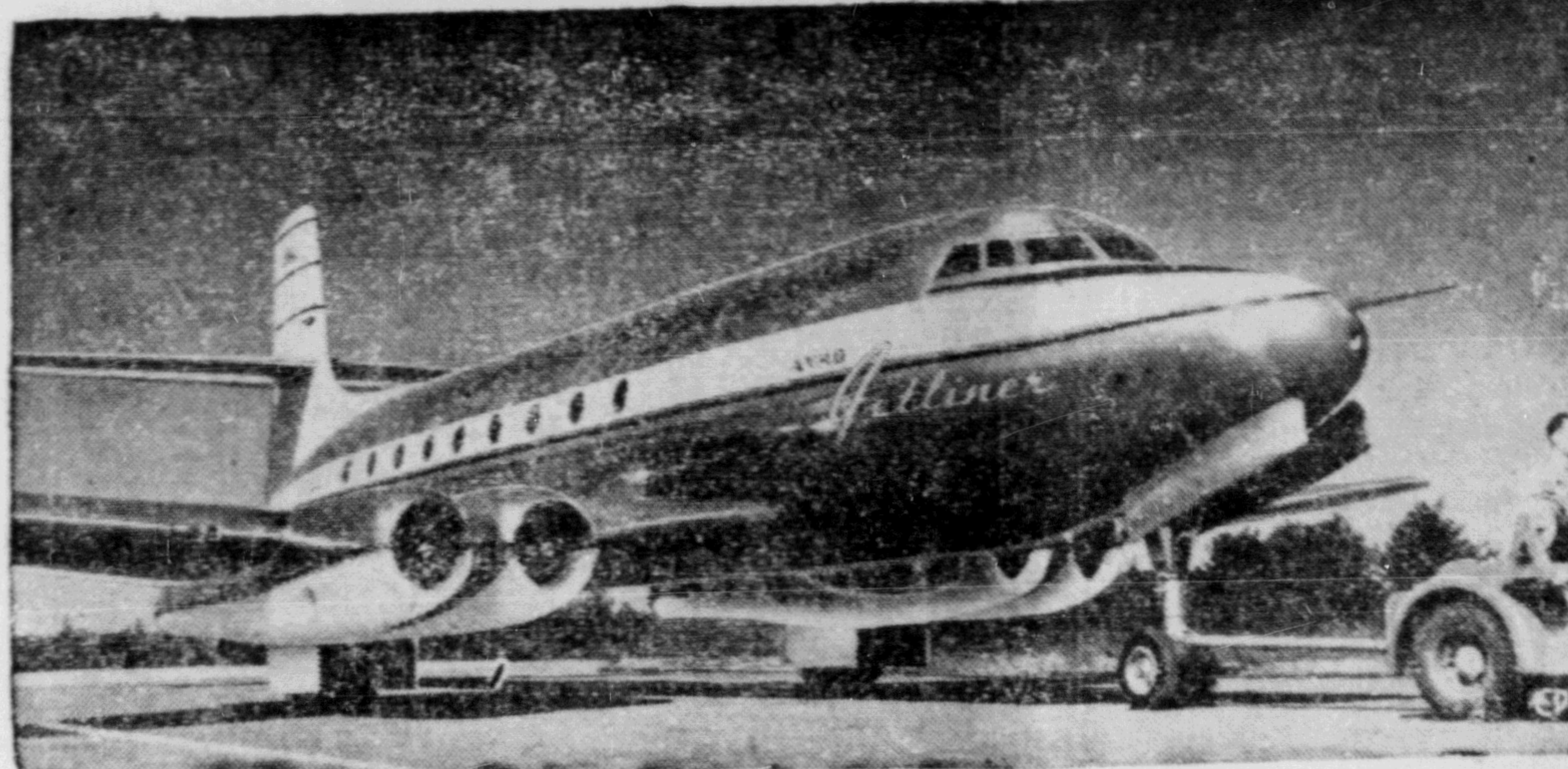
JETLINER FLIES —Entirely designed and produced in Canada, this jet propelled air liner was unveiled at Toronto's Malton airport this week. It is the only aircraft of its type in North America and the second jet passenger liner in the world. It threatens United States supremacy in the aircraft manufacturing field. Known as the Avro C-102, the craft is shown being towed onto the runway prior to the first flight. Built by A. V. Roe Canada, Ltd., the craft is designed to carry 50 passengers at 430 miles an hour flying at 30,000 feet. It is powered by four jets.

Forecast North Coast Region—Overcast with rain today. Cloudy with showers Tuesday. Little change in temperature. Winds—South-