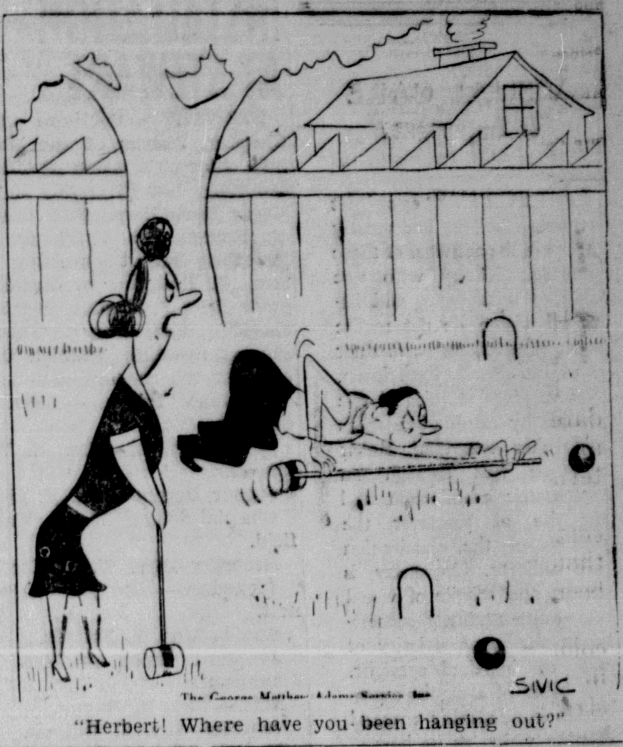
"Herbert! Where have you been hanging out?"

VANCOUVER — The Fraser Valley flood, calamitous as it is, involves only about 20 per cent of the valley's milk production. An estimated 80 per cent of the dairy farms of Chilliwack, much of Sumas, all of Cloverdale, Ladner and Lulu Island are doing business as usual.