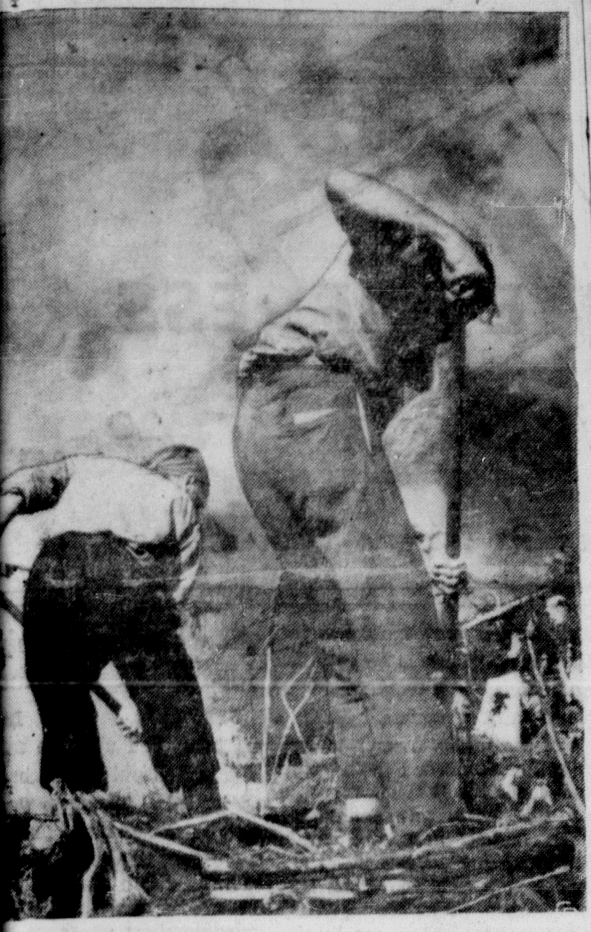
FIGHTING FIRES IN NORTHERN ONTARIO —Nine great fires lately swept the tinder-dry north bush of Ontario. There were several smaller ones. The whole country was "tinder-dry" as men battled the flames. Some commercial planes, along with 30 departmental planes, were busily engaged in fighting the fires. Workers are shown here busy at work. Fish and wild life were ruined for 50 years, officials state. Millions of dollars of red and white pine were destroyed.