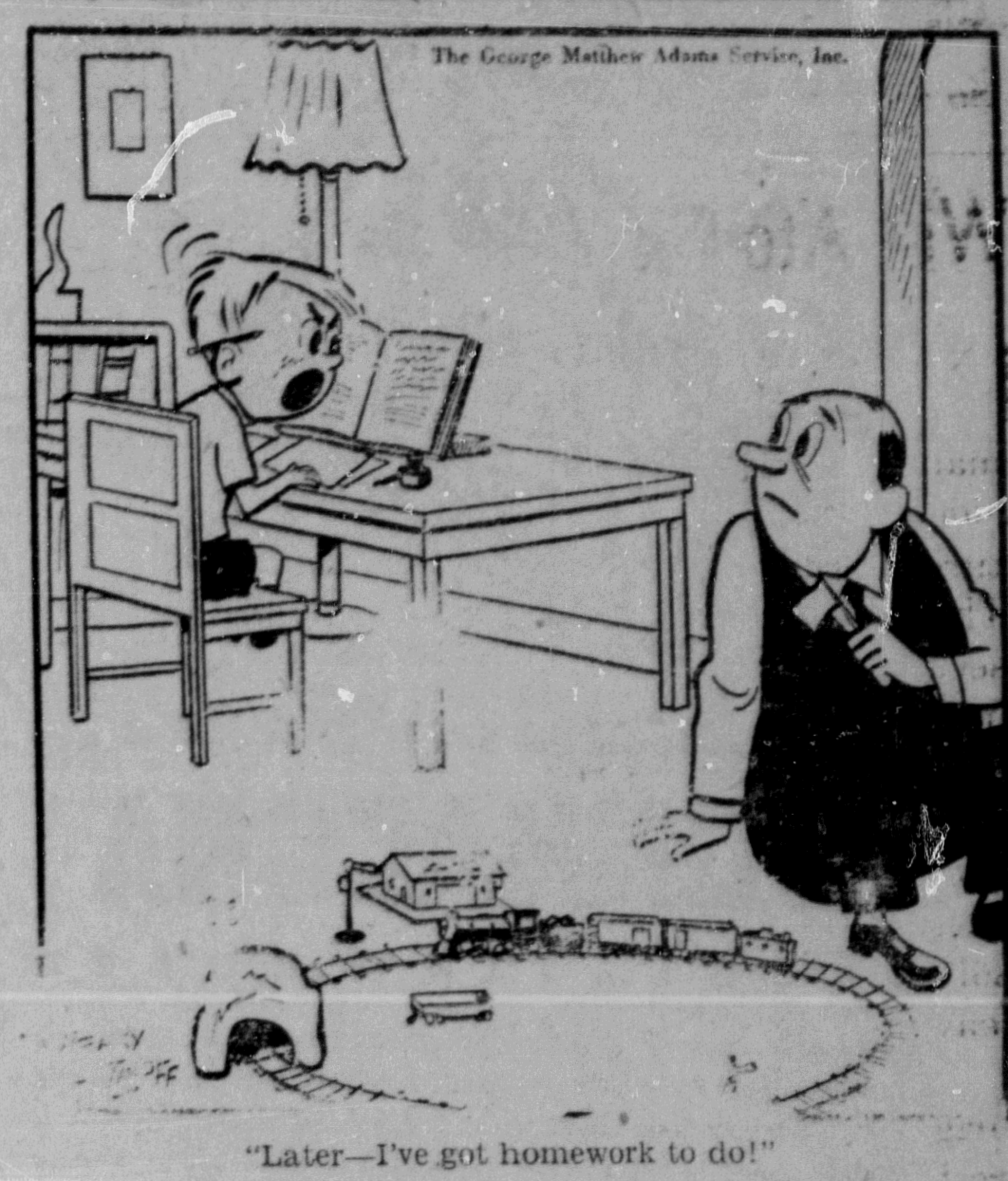
"Later—I've got homework to do!"