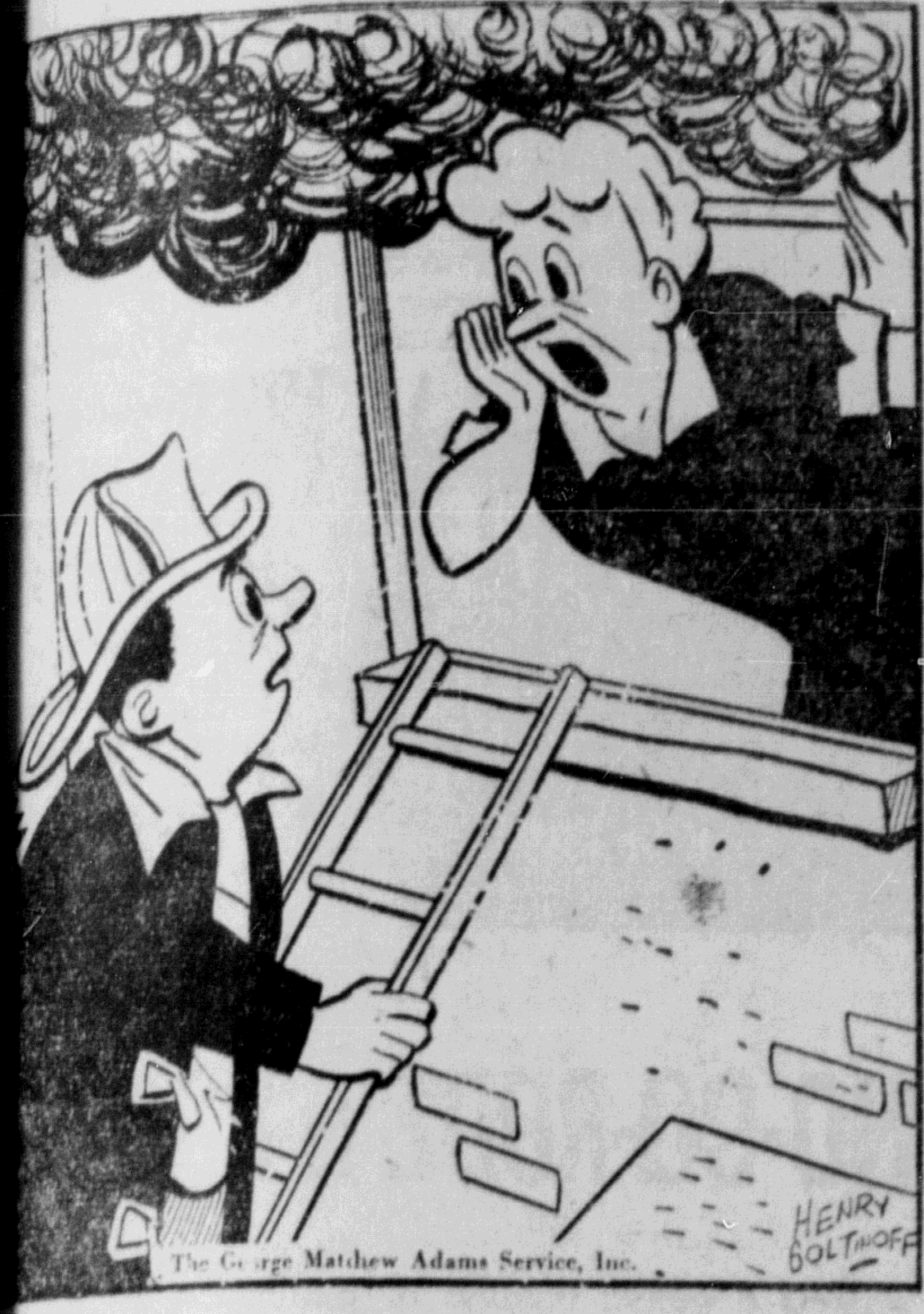
"Hurry! There's a mouse in the room!"