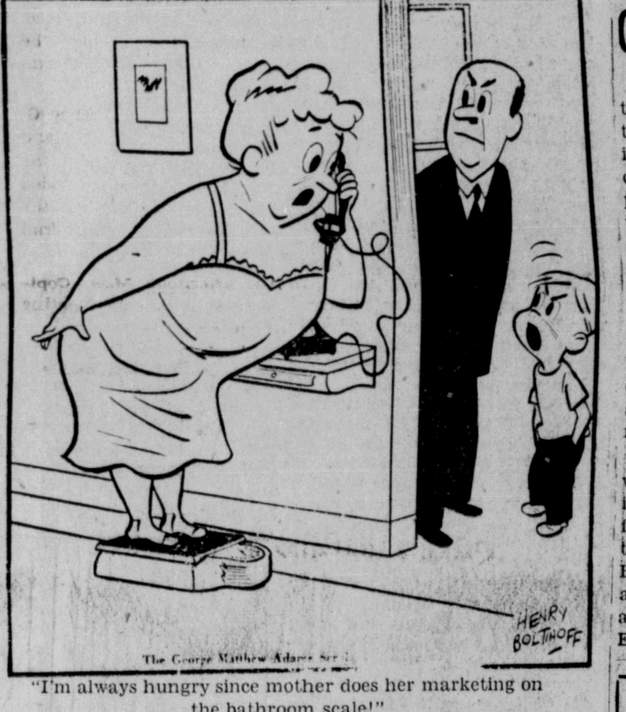
"I'm always hungry since mother does her marketing on the bathroom scale!"