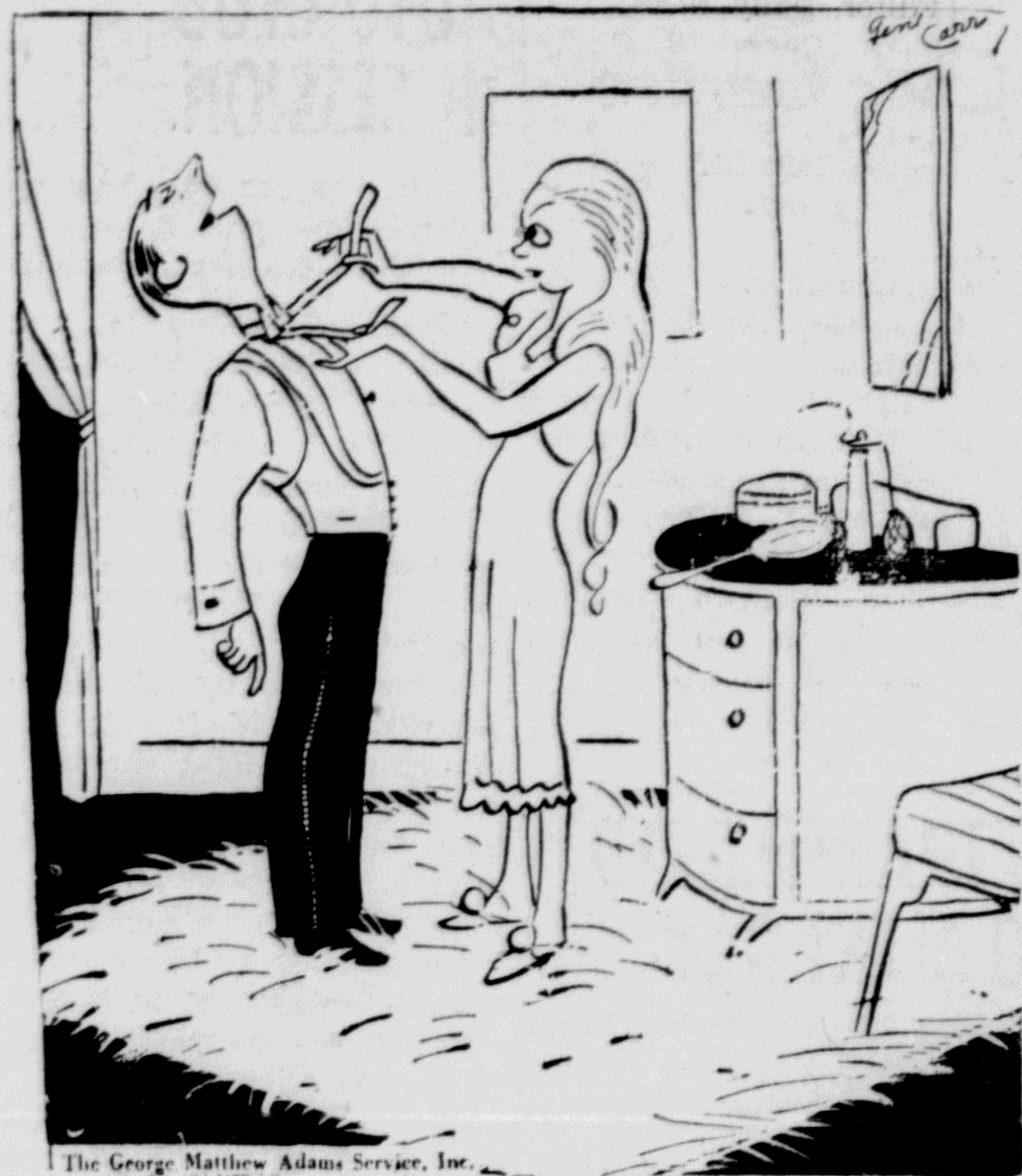
"When you finish my tie, please see if you can find my white muffler, and for Pete's sake hurry and get dressed. We have to leave here in a few minutes."